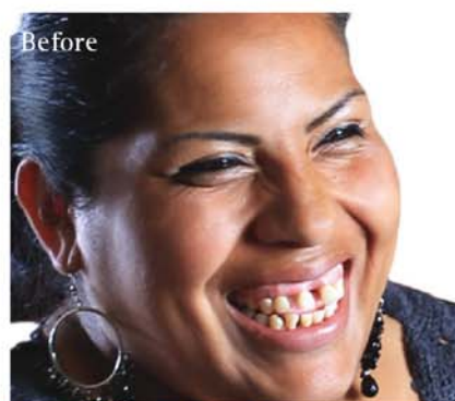
Actual ClearChoice Patient