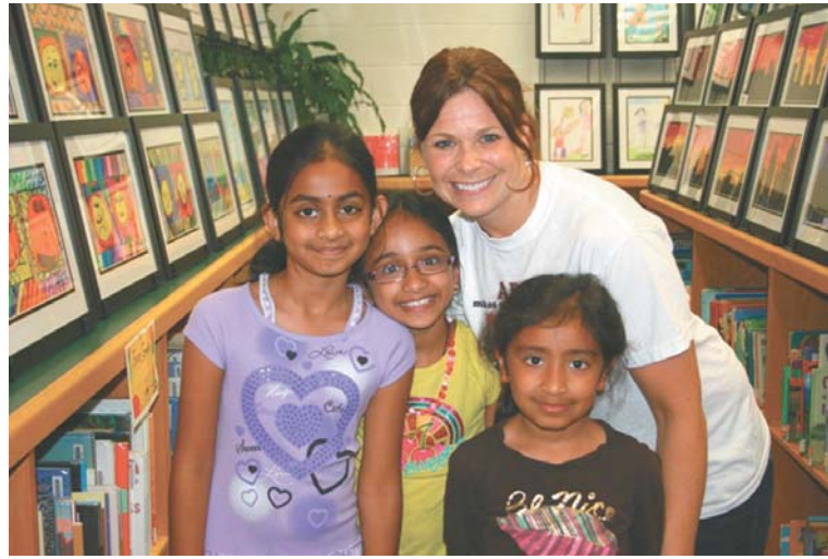
Art teacher and students at McNair Elementary's art fair.

One-on-One English Practice. 2 p.m. Oakton Library, 10304 Lynnhaven Place, Oakton. Call for appointment with an ESL volunteer. Adults. 703-242-4020.