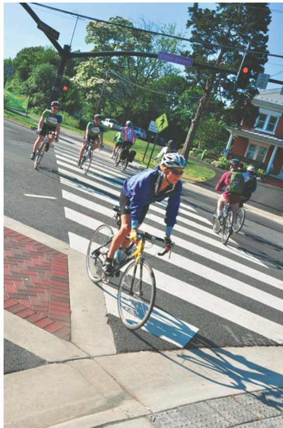
Cyclists cross Elden Street in Herndon along the W and OD Trail, part of Bike to Work Day Friday, May 18.

"My New Year's Resolution was to get out and bike more, since it's something I really hadn't done since college. I think I've probably biked from my house to my office in Vienna about a dozen times this year, mostly in the last month," he said. "I'm not as hardcore as I should be I guess, because I only really do it on nice days, when I've planned for it. But if they had snacks here every day, I'm sure I'd be more