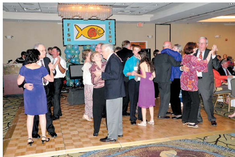
Guests hit the dance floor during the annual FISH Fling Saturday, May 19 at the Crowne Plaza in Herndon.