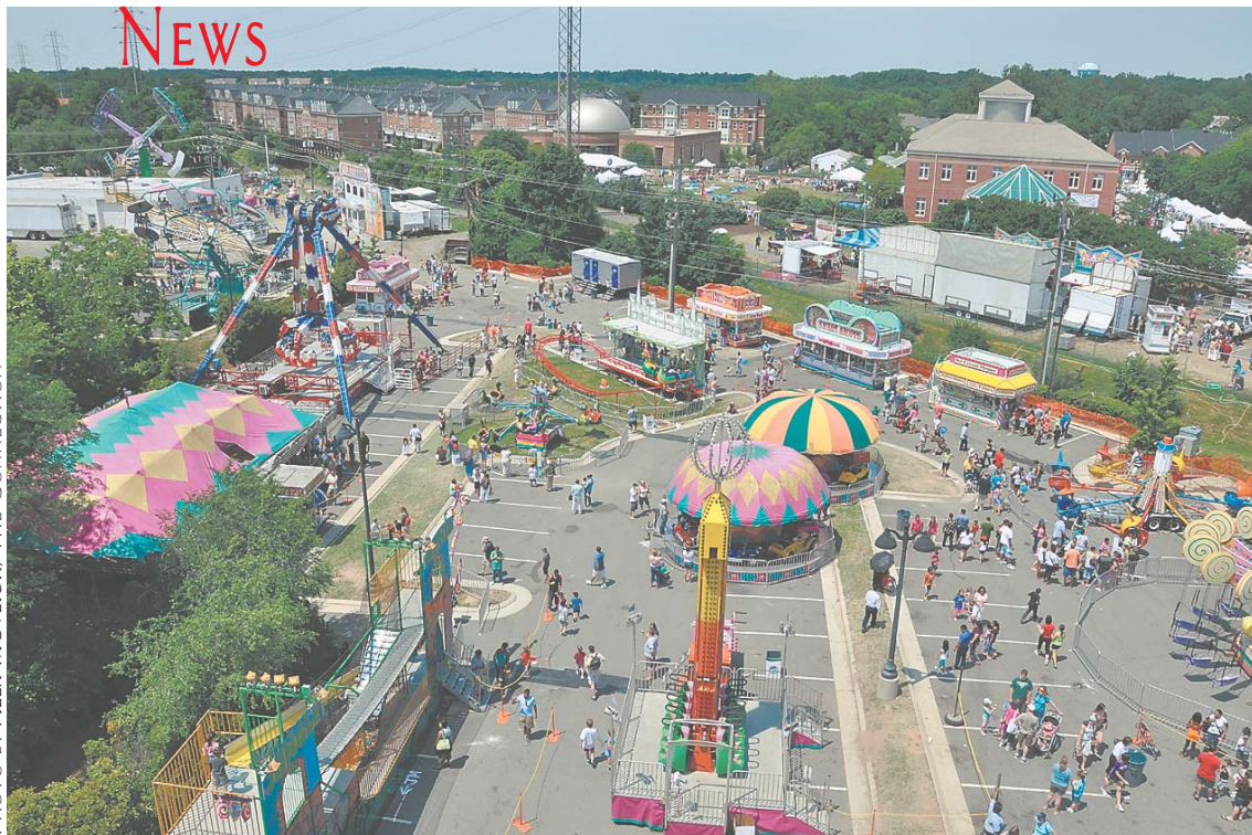
Visitors to the Herndon Festival bend the rules of gravity on the Zipper (left) or the Round Up (right).