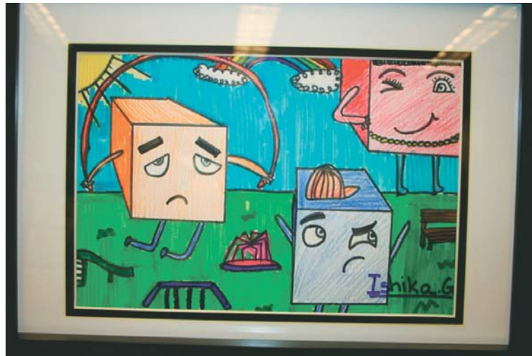
Box art at McNair Elementary's art fair.

eBook/eReader Instruction. 7:30 p.m. Oakton Library, 10304 Lynnhaven Place, Oakton. Learn about library ebooks and how to access them with your compatible device. Call for an appointment. Adults. 703-242-4020.