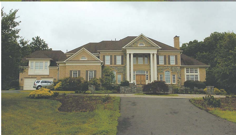
7 760 Strawfield Lane, Great Falls — $1,806,000