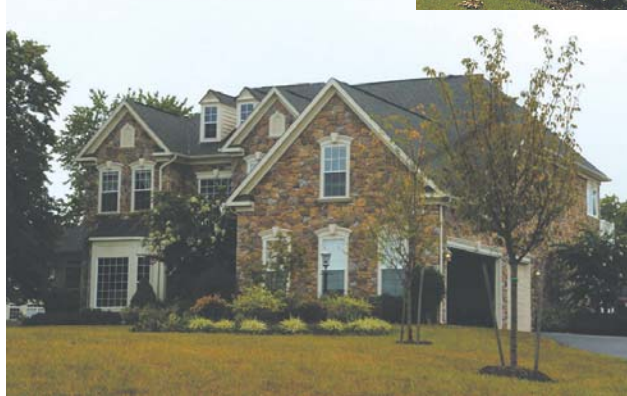
11 12605 Oxon Road, Oak Hill — $1,307,000