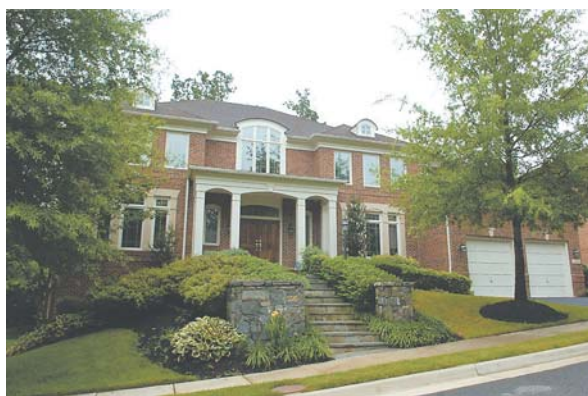
12 11085 Pelham Manor Place, Reston — $1,140,000