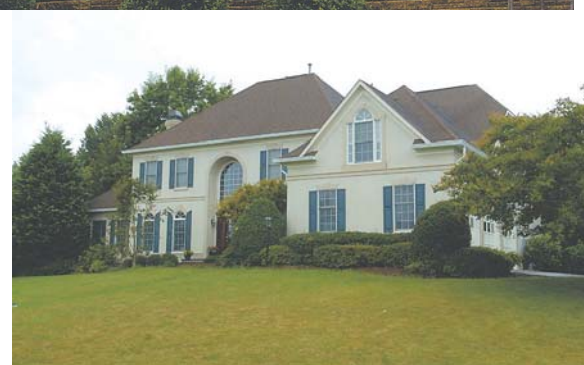
10 2621 Sledding Hill Road, Oakton — $1,480,000