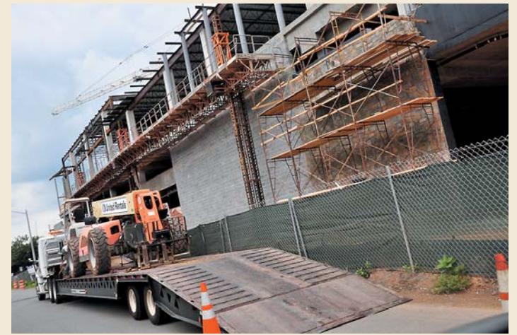
Fairfax County released its latest recommendations for Tysons Corner redevelopment, and the McLean Citizens Association feels that they do not give enough information.