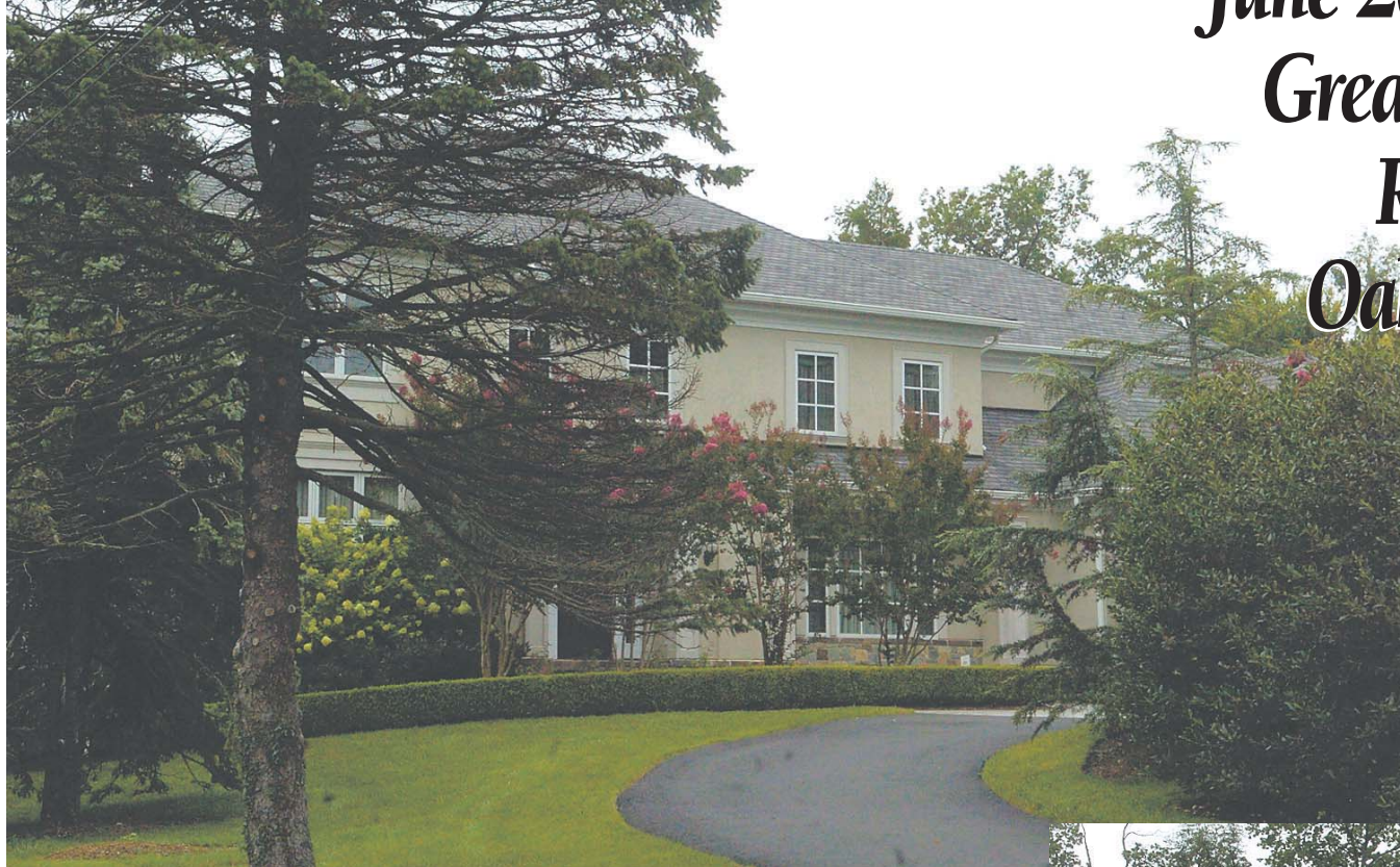
1 935 Douglass Drive, McLean — $3,250,000