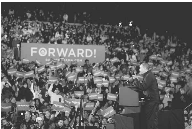
Barack Obama came to Northern Virginia on Saturday, Nov. 3 with Bill Clinton and Dave Matthews.