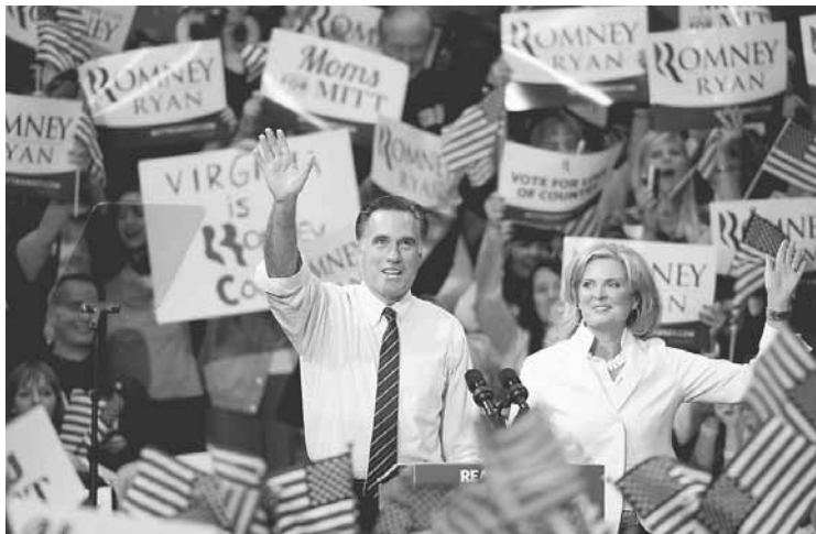
Mitt Romney packed the Patriot Center at George Mason University on Monday, Nov. 5. Anne Romney asked: "Will we be neighbors soon?"