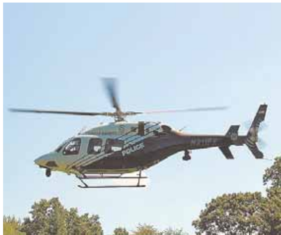
Saving lives: FCPD helicopter on a rescue mission.

After reuniting the boy with his parents, helicopter officers heard a call for emergency help at 4 p.m.