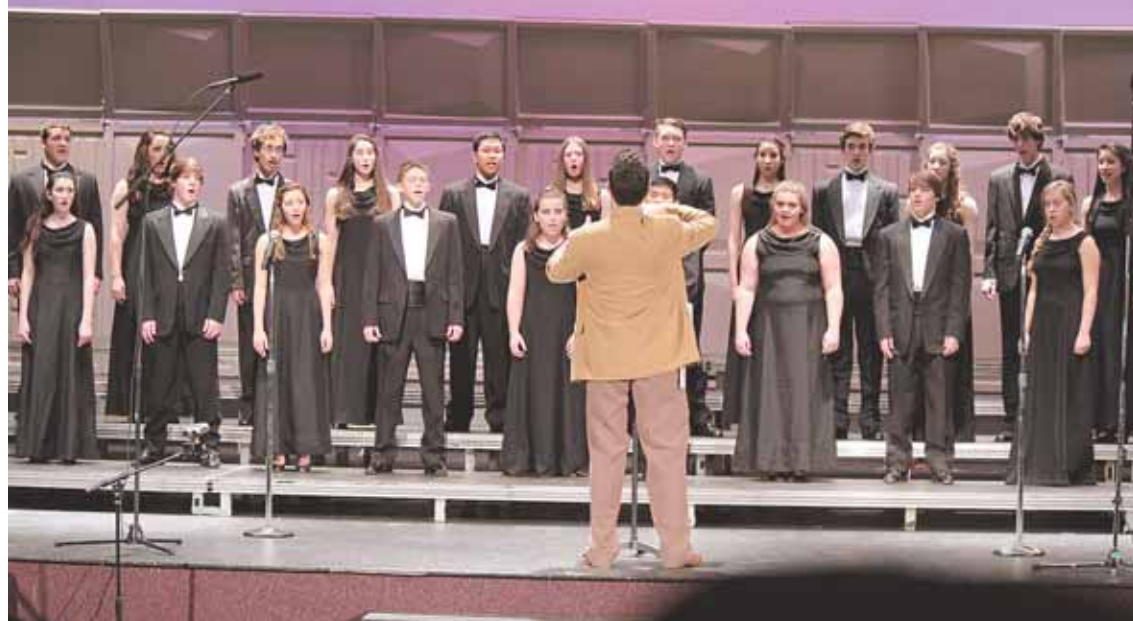
The Chantilly Chamber Chorale performing at the fall concert.