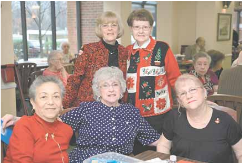
Residents at the Lake Anne Fellowship House also gather for similar events and celebrate holidays. At Lake Anne, 53 percent of the residents are Caucasian, 35 percent are Asian and the remainder are African American, Indian and Hispanic.

Neighborhood Resources at Reston Interfaith.