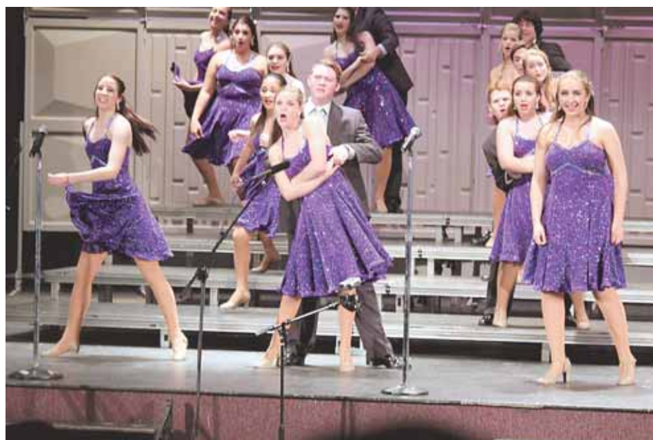
Chantilly High's ShowStoppers perform at the fall concert.