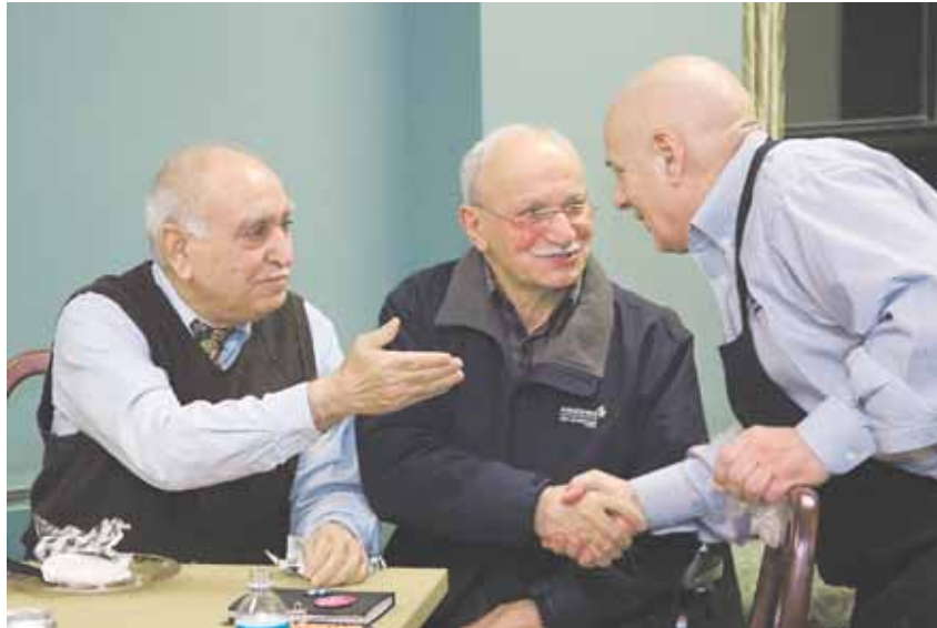
Every other month at Hunter's Woods Fellowship House in Reston, residents attend an International Tea and share dishes from their country of origin, with one such function pictured here. At Hunter's Woods Fellowship House, 50 percent of the residents are Asian, 21 percent are from Middle Eastern countries and the remainder are Russian, Caucasian and Hispanic.