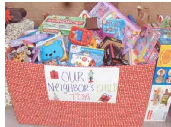
Some of the toys donated to ONC during the toy drive at Walmart.