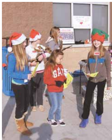
Creative Dance Center members hand out flyers explaining the ONC toy drive.