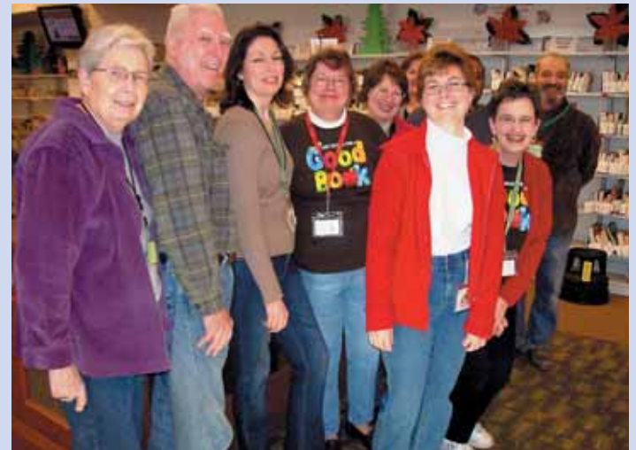
Employees with the Fairfax County Regional Library