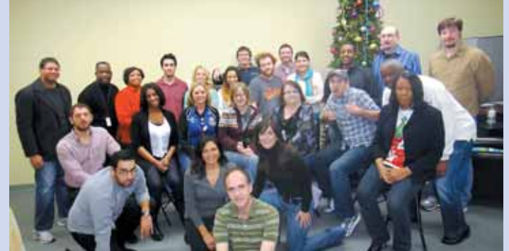
Employees of group Z in Tysons Corner