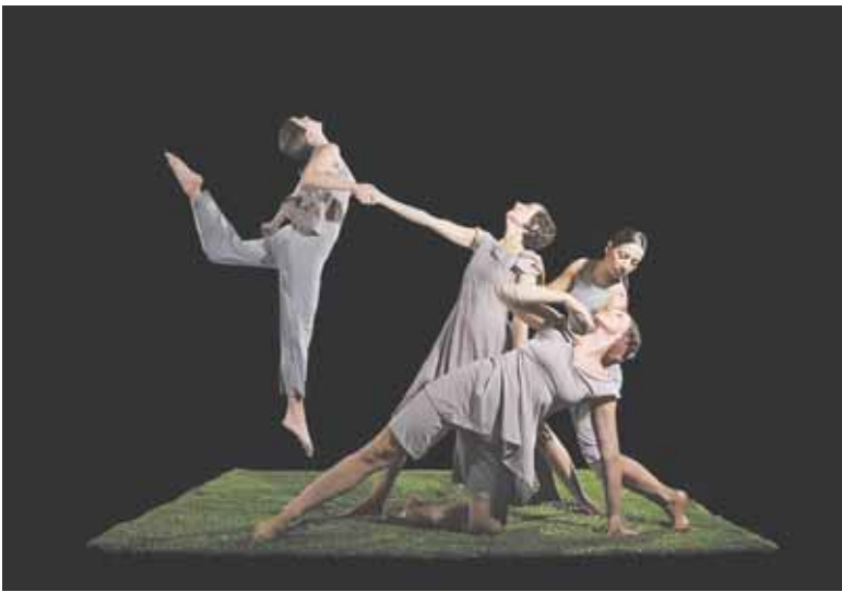
Dancers from the en Route! touring dance project.

Live Onstage: The Amazing Gospel Souls. 11:30 a.m., in the W-3 Theatre at the Workhouse, 9601 Ox Road, Lorton. The gospel band conceived inside the notorious Lorton prison system in the early 1980s is comprised of ex-offenders from the Washington, D.C., area who have collectively served 200-plus years in