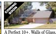
COMING SOON A Perfect 10+. Walls of Glass, Pool, Updated Throughout