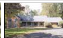
Under Contract in 3 Days