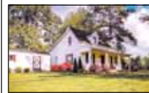
Under Contract in 3 Days