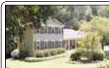
Under Contract in 3 Days