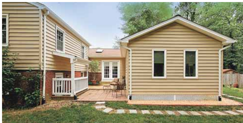
The multi-generational solution introduced by Sun Design Remodeling includes a one level seniors wing supplemented by a sitting area that exits through French doors to the newly formed courtyard. Hallways and doors in the new section are wheelchair friendly.