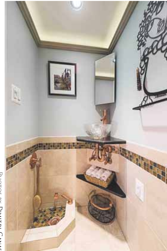
The Pipers' new powder room includes a Mediterranean-style foot bath ringed in glass and mosaic tiling.

The plans for a kitchen remodel were complicated by the fact that the home's rear elevation backs into a woodland set-aside and a notably precipitous drop.