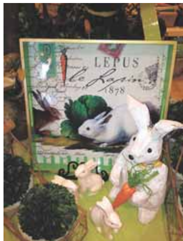
Local design experts suggest using serveware imprinted with produce like lettuces that herald the new season.