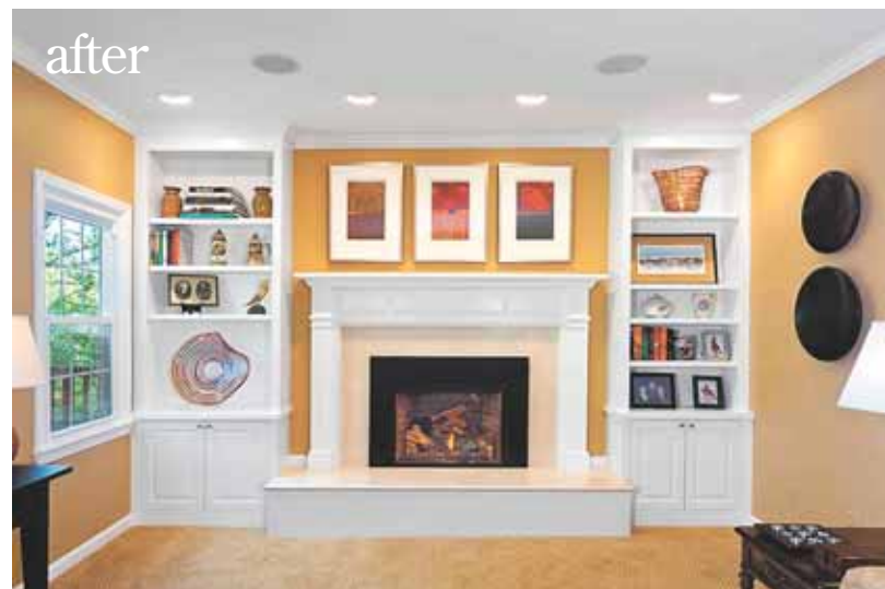
The existing half-brick floor-to-ceiling backwall was replaced by perfectly symmetrical built-ins, crown molding and an elevated hearth with a marble surround and Edwardian-style mantle.