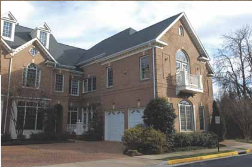
5 3871 Lewiston Place, Fairfax — $1,025,000