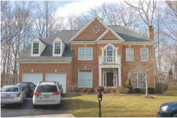
7 7438 Spring Summit Road, Springfield — $800,000