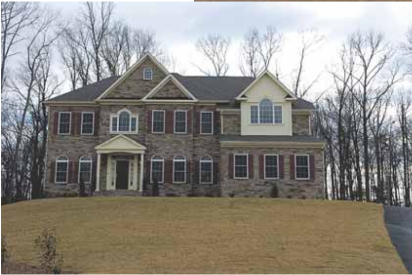
3 11391 Amber Hills Court, Fairfax — $1,160,928