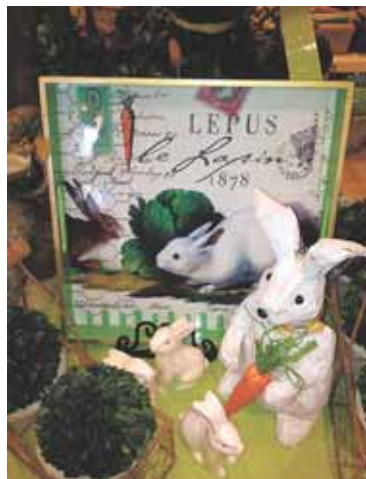
Local design experts suggest using serveware imprinted with produce like lettuces that herald the new season.

O'Shields said, "Pick one flower style and repeat it in various places throughout the room for the most impact."