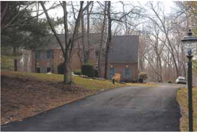
6 12606 Clifton Hunt Lane, Clifton — $920,000