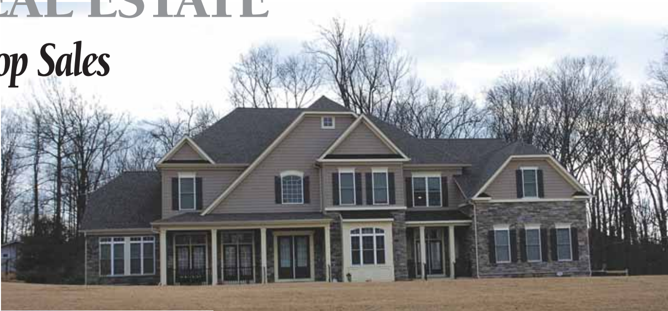
1 11399 Amber Hills Court, Fairfax — $1,476,665