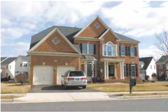
9 13509 Lamium Lane, Centreville — $781,000