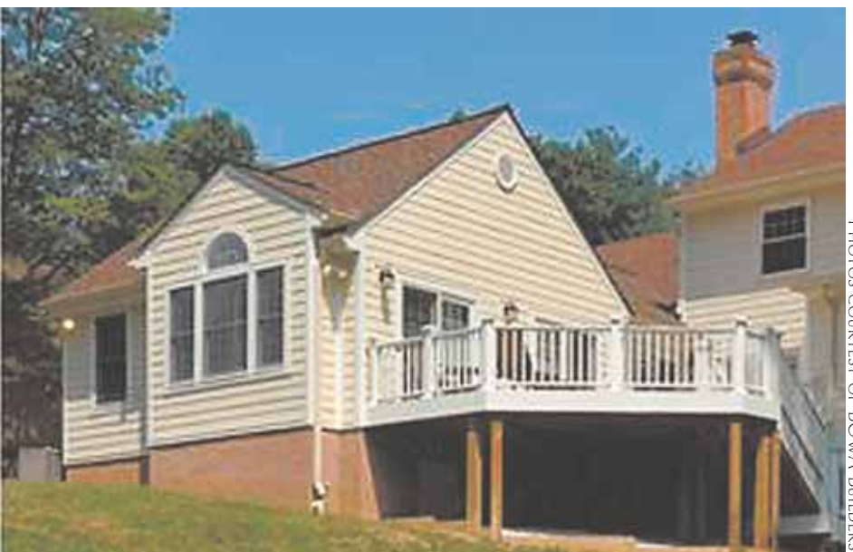
The addition of a main-level master suite with easy access to outdoor living space paves the way for aging in place and family entertaining.

In instances when a small lot or zoning restrictions hamper the ability to add on square footage for a master suite or other area, there are alternative options to help a family stay in their home. There may be seldom-used space on the first floor that