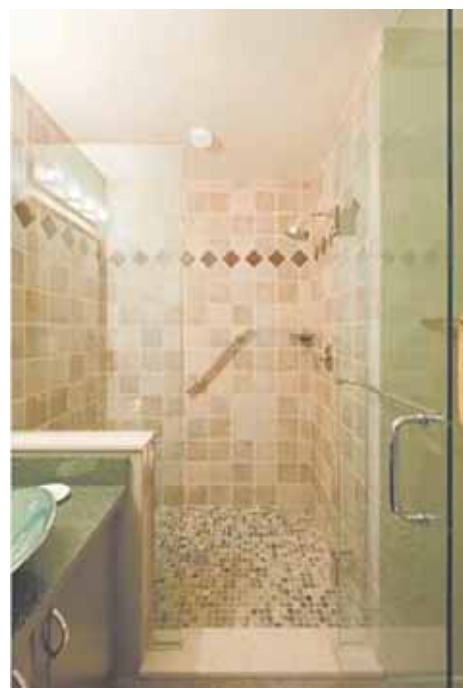
Grab bars in shower and easy access help set the stage for seamless aging in place.

decision involves revamping existing space or incorporating a user-friendly residential elevator into the home. In many cases couples opt to add ground-level space in a way that complements the home.