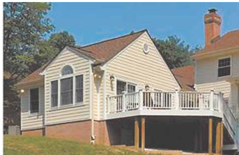
The addition of a main-level master suite with easy access to outdoor living space paves the way for aging in place and family entertaining.

With all of these changes, it is important to maintain the current look and feel of your home as much as possible, so consider choosing materials and colors that match the style of the rest of your home.