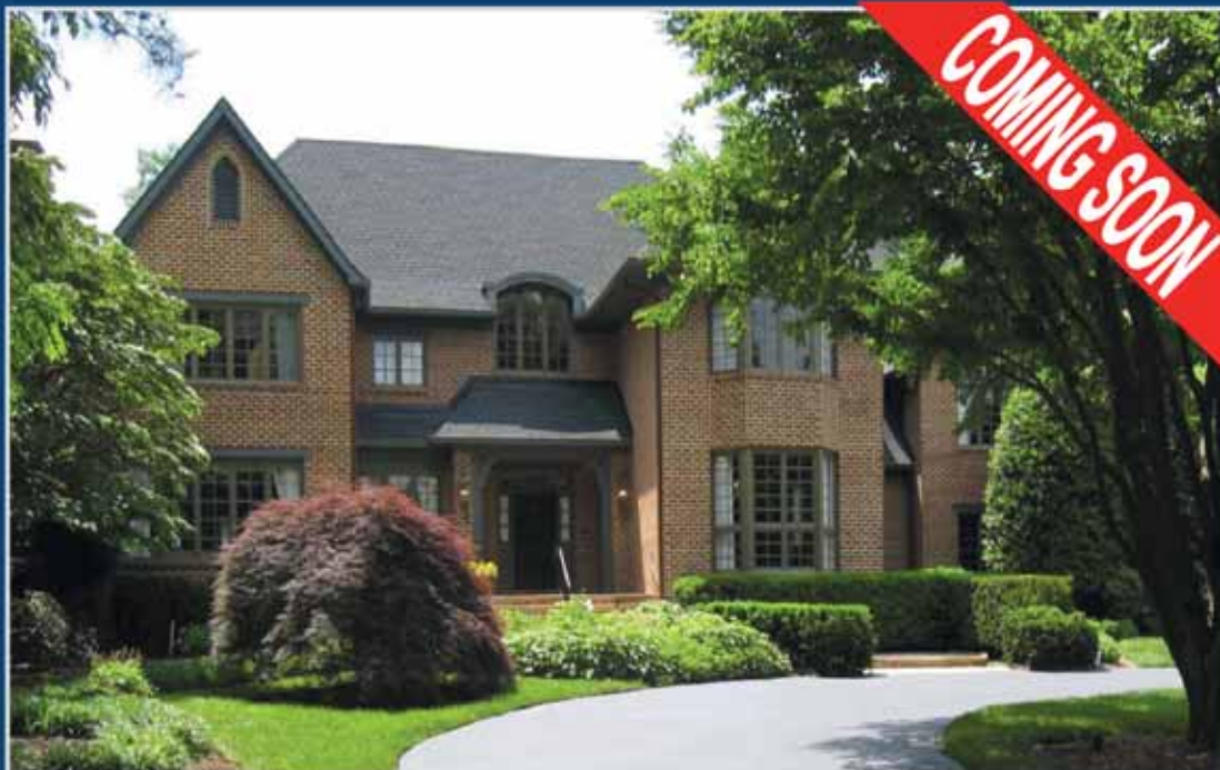
Ballantrae Farm Drive McLean, VA $2,695,000