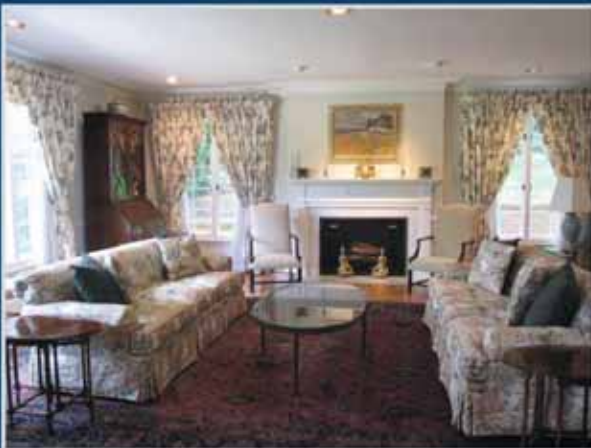
Elegant Living Room

Exquisite custom built English Manor home in McLean's most prestigious neighborhood, 10 minutes to the White House! Lush near acre private setting includes heated pool, tennis court and circular drive. This charming home's superior finishes and upgrades include; two story foyer w barrel vault ceiling, banquet size dining room w fireplace, expansive library w beautiful mill-work, gourmet kitchen with sundrenched breakfast area, large master suite with two full (his and her) baths, palladium windows, scenic views and more! Call me for a private showing.