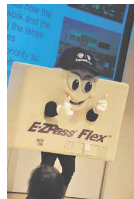
EZ Pass unveils Flexy, their new mascot, at the annual Keep Tysons Moving event Thursday, June 27 at Gannett Headquarters.

The project plans are about 30 percent completed, with construction expected to start in the summer of 2016 and finishing by spring 2018.