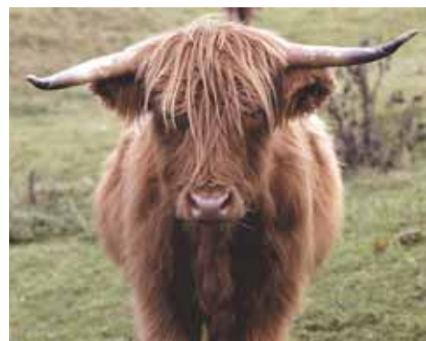
A Scottish Highland cow.

The bull turned out to be a Scottish Highland cow that had escaped from a farm on Winfield Road in Fairfax on Thursday, July 11. It had been loose for