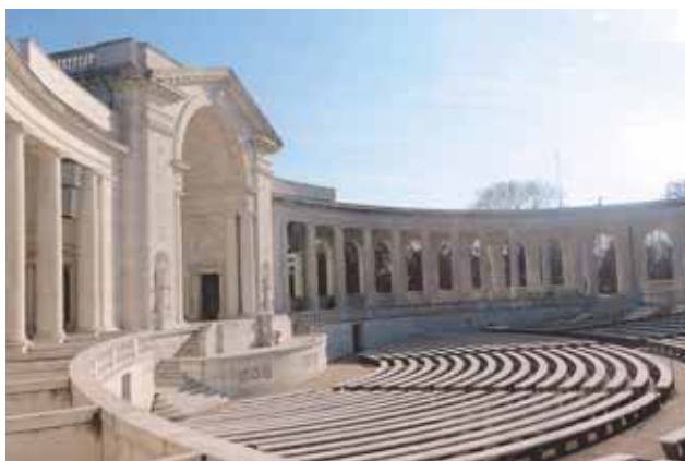
The Memorial Amphitheater at Arlington National Cemetery.

Public parking is not available at the Pentagon; visitors have easy access via public transportation available at the Pentagon Metro station or parking at the nearby Pentagon City Mall.