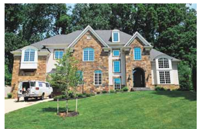
6 4607 33rd Street North — $2,445,183

COPYRIGHT 2013 REAL ESTATE BUSINESS INTELLIGENCE. SOURCE: MRIS AS OF JULY 15, 2013.