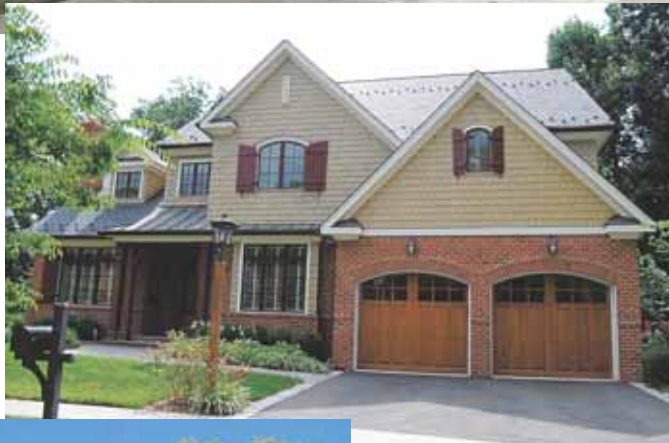
5 4109 Randolph Court — $2,523,750