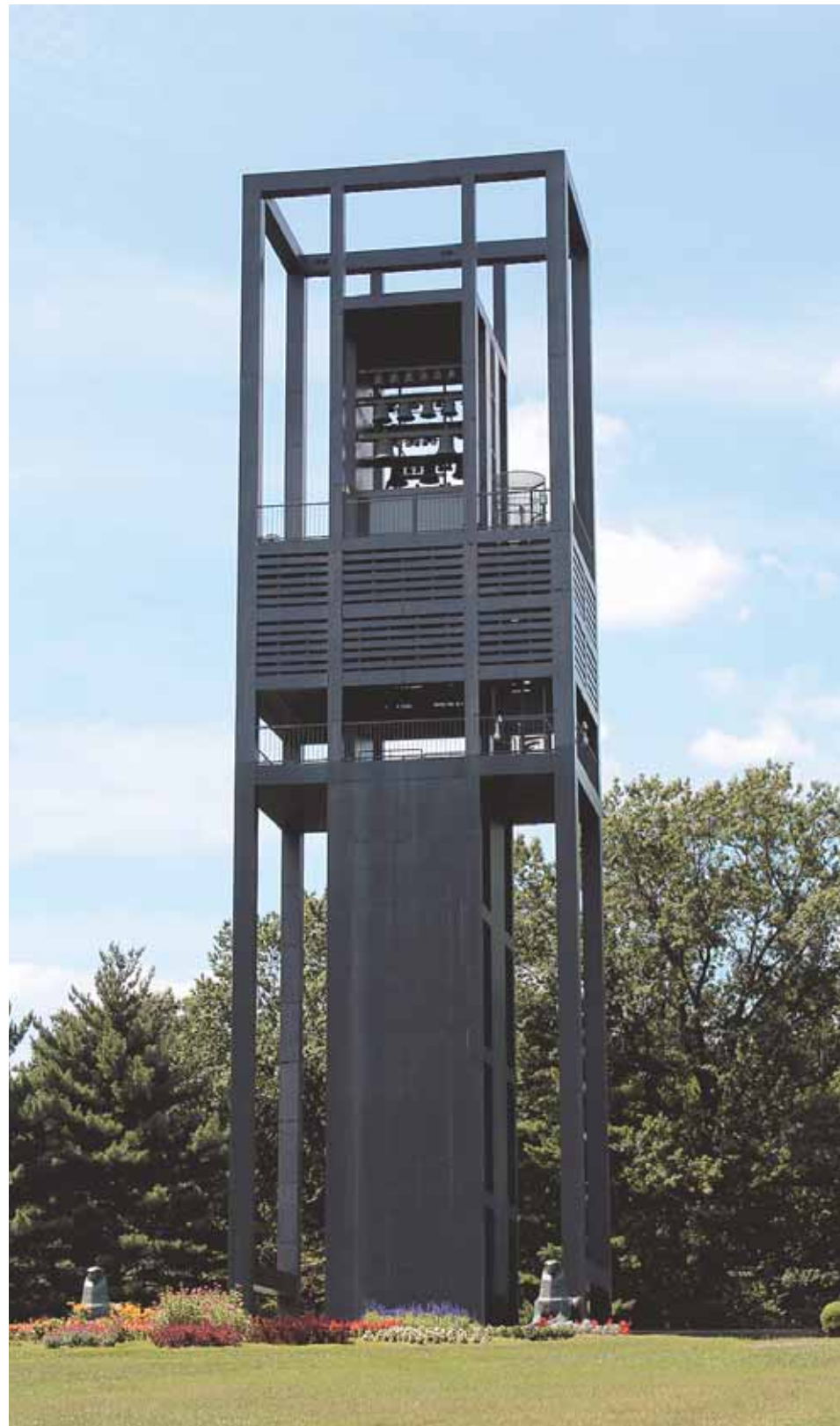
The Netherlands Carillon in Arlington Ridge Park