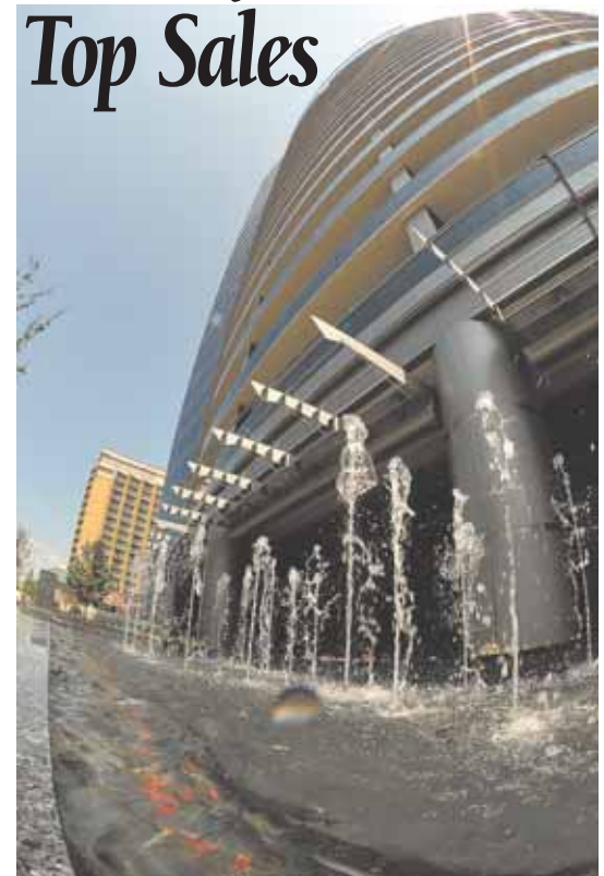
1881 Street North 2 #2101 — $3,600,000 4 #2202 — $2,642,000