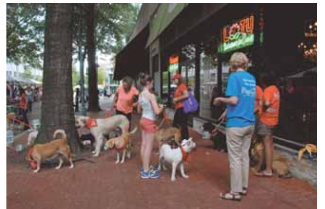
Wags n' Whiskers allows shoppers and their pets to explore more than 50 onsite exhibitors, pet services and pet adoption organizations. Attendees also enjoyed live music, demonstrations and activities for children. Volunteers from K-9 Lifesavers dog rescue stand on Campbell Avenue with friendly pets looking for a home.