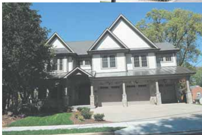
10 4806 Little Falls Road — $2,000,000