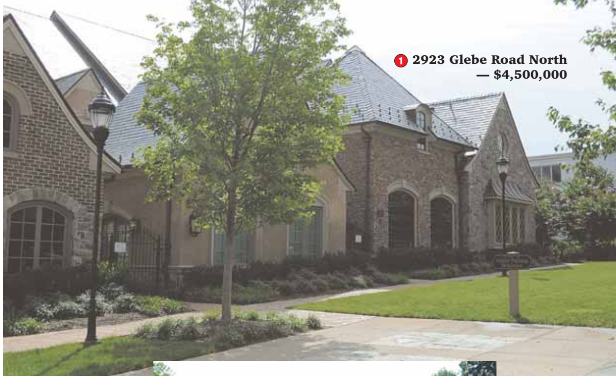
1 2923 Glebe Road North — $4,500,000