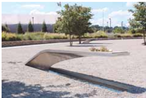
First bench at Pentagon Memorial, dedicated to the youngest individual killed on September 11, 2001.

One of the stops along the Mount Vernon Trail — Gravelly Point Park — is another hidden pleasure of Arlington. This low-key park is located beside the Reagan National Airport and has sweeping views of Washington's monuments across the Potomac River. With the trail lining one side and the George Washington Parkway lin-