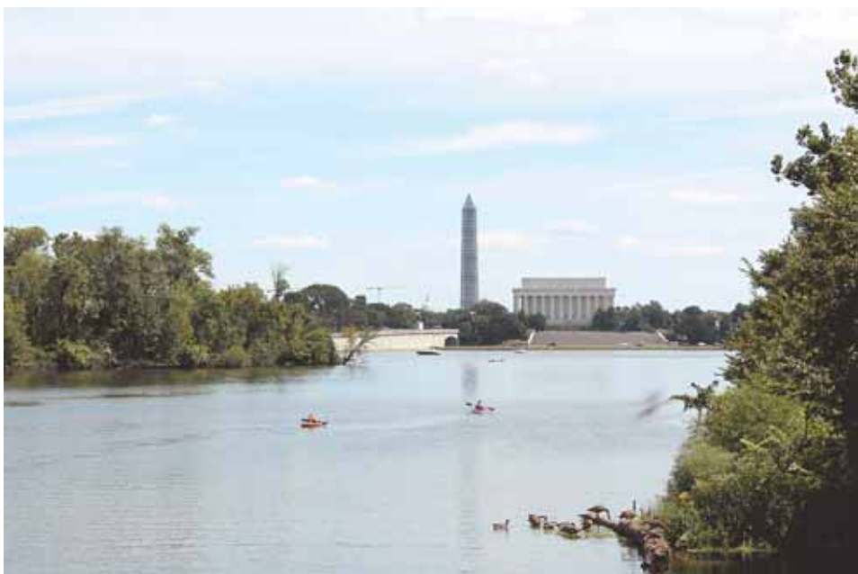
View from the Mount Vernon Trail.