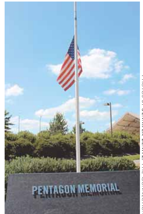
Pentagon Memorial dedicated to the 184 individuals who perished at the Pentagon on September 11, 2001.

be prepared to do a lot of walking, Arlington National Cemetery provides plenty of things to see.