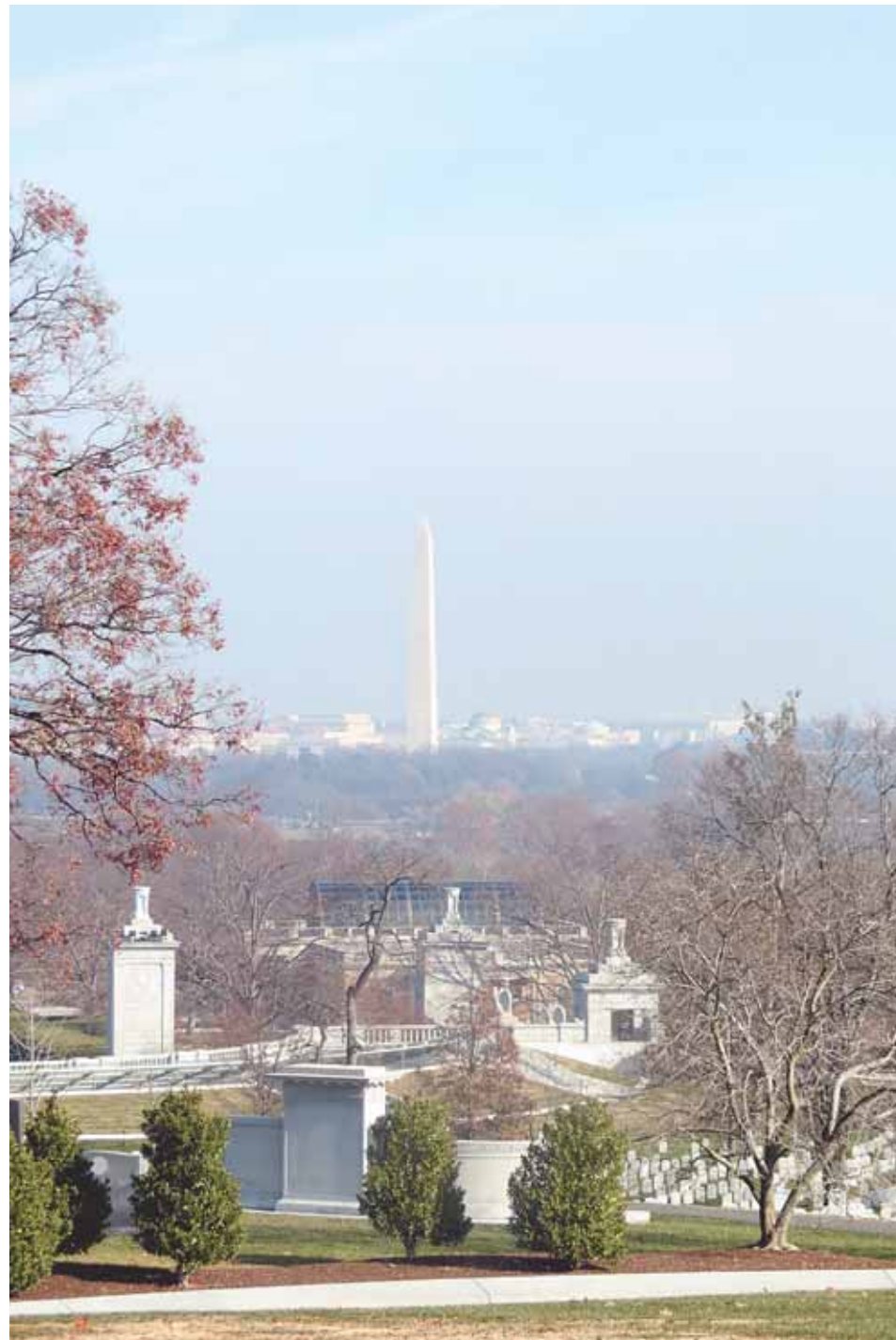
View from Arlington National Cemetery.

Other must-see attractions while in the cemetery are the changing of the guards, the Tomb of the Unknown Soldier and the Memorial Amphitheater. Although one must