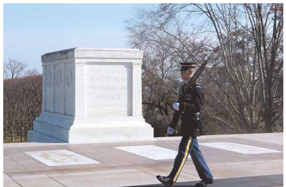
Tomb of the Unknown Soldier at Arlington National Cemetery.