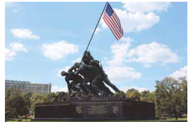
The U.S. Marine Corps Memorial, also known as the Iwo Jima Memorial.