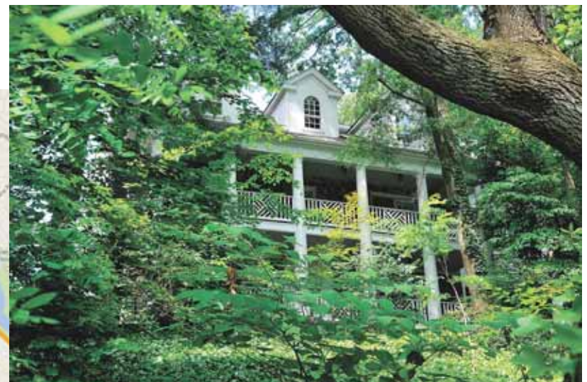
3 3812 Military Road — $2,850,000