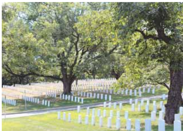
Arlington National Cemetery.