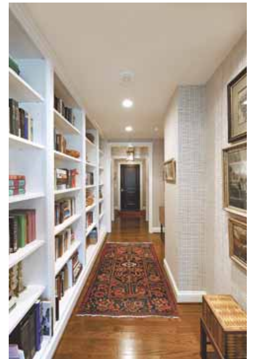
This renovation features custom woodwork and built-ins to maximize space.

Renovating a condo is completely different, but it doesn’t have to be bad, he said. You can create “brand new luxurious space out of something that wasn’t that way before.”