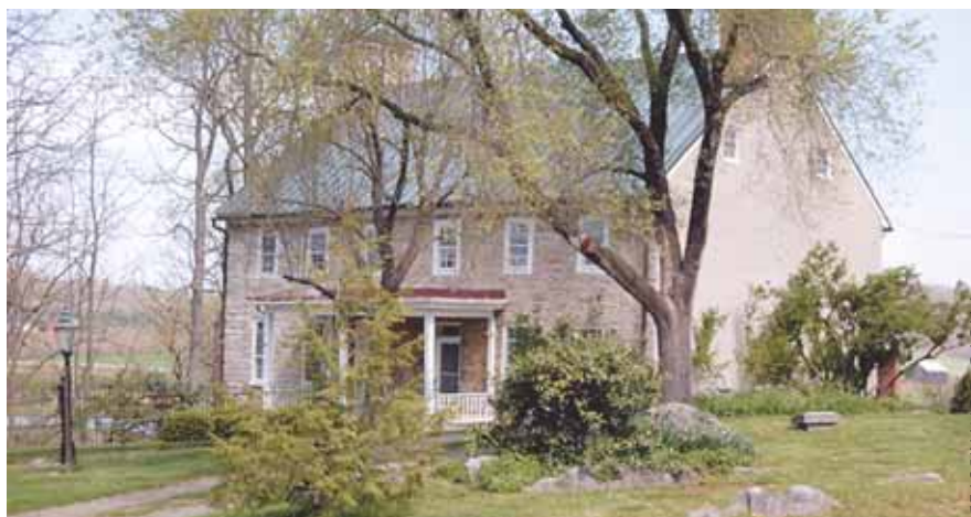
Long Green, an 18th century home in the Shenandoah Valley, is made over to benefit Blue Ridge Hospice.

Purchase online at winchestershowhouse.com or by calling 540-313-9268.