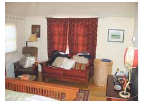
BEFORE: The old L-shaped configuration consisted of two converging legs, both too narrow for comfortable habitation, the owners say.

Choosing lighter reflective colors for wall surfaces, the new scheme draws out the brighter natural ambiance of a room that