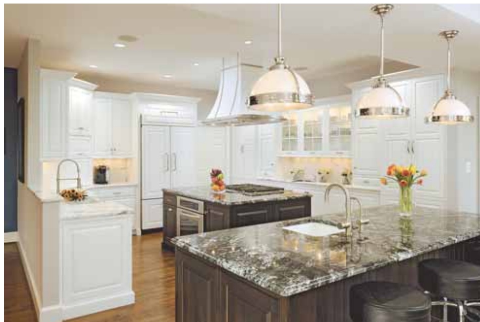
This renovated kitchen gained storage and space saving features.