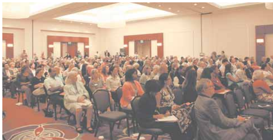
Members of the Northern Virginia Realtors Association filled the conference hall at the Mason Inn on the campus of George Mason University for the 17th Annual NVAR Economic Summit.