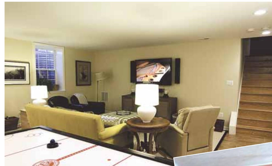
Moving TV-viewing from the living room to an upgraded lower level has made the first floor far more functional while adding an element of privacy to the new master suite.