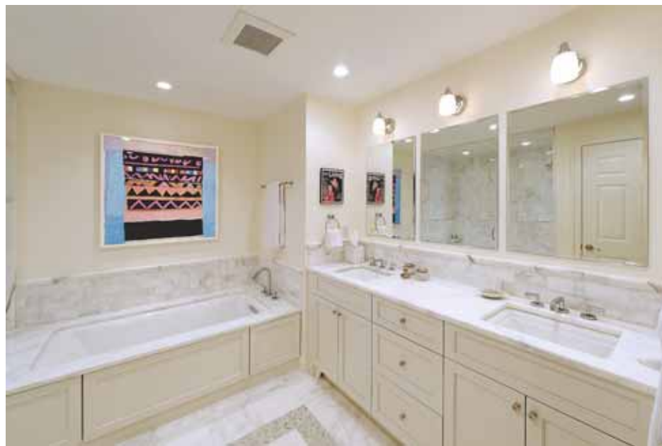
This BOWA-remodeled master bath illustrates the recent trend for all-white bathrooms.