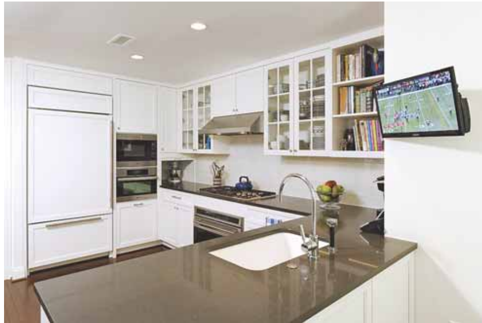
This remodeled Chevy Chase condominium kitchen included a sleek kitchen with ample storage.

RENOVATING CONDOMINIUMS is fundamentally different than renovating a single-family home, and it requires very different expertise, even if the desired outcome inside might look similar.