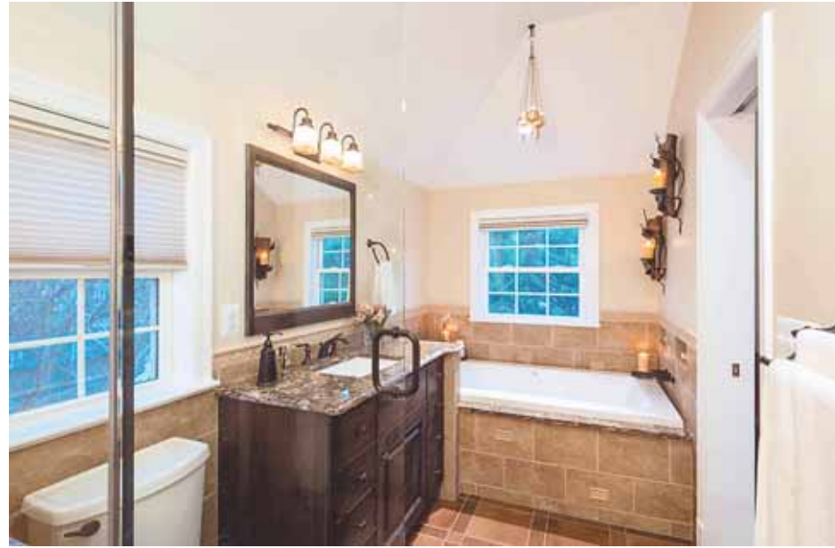
The master bath is articulated in Tuscan accents: natural clay tile combined with maple cabinet facings brushed in black stain; a tile wainscoting unifies the entire room including a spacious soaking tub.

"That meant we were looking for more usable space inside the existing structure," Wolf explains. "And this is the real frontier in older close-in homes; it's interior space planning that has really revolutionized the