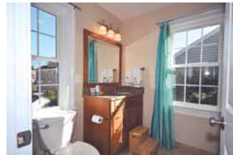
BEFORE: No room for a soaking tub here. While Wolf's only deletion was a small linen closet, the designer says that "inches count" in a tight-space plan solution.

Specifically, previous owners had constructed a rear elevation two-level wing with the master bedroom on top accessible through a small bedroom in the main house. The suite itself was configured as an L-