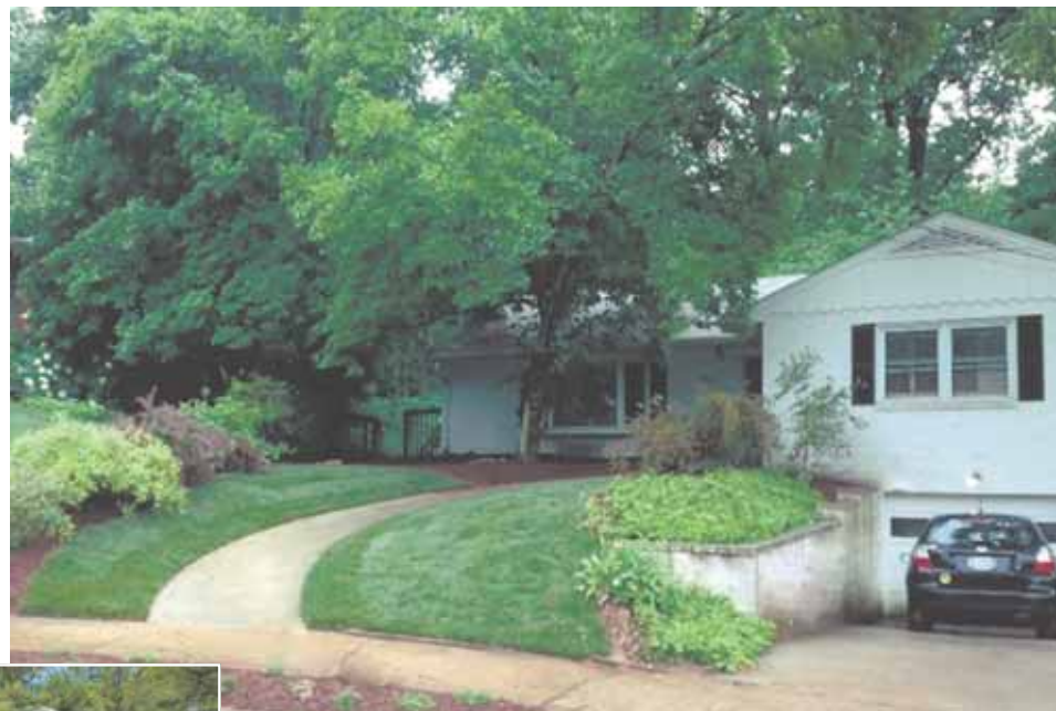
When Jaime Marquez began having difficulties getting from the house to the driveway, Glickman Design Build created a graduated front walk for the Arlington family. The new walk rises one inch per foot. The plan included replacing a front stoop with a "zero step" entry and widening interior doors and halls.

Also, she notes, the new front walk adds considerable curb appeal. "Honestly," she said, "I wish the walk had been in place when I was still pushing the girls in their stroller. It's just a lot easier for everyone."