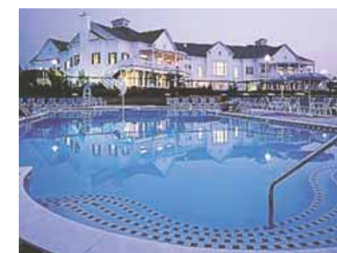
Retirement communities like Heritage Hunt Golf and Country Club in Northern Virginia offer seniors options for maintaining an active lifestyle such as indoor and outdoor pools, tennis and golf.

living is for people who have physical needs or limitations. I don't think of nursing homes as senior housing. It is long-term health care or for someone who is recover-