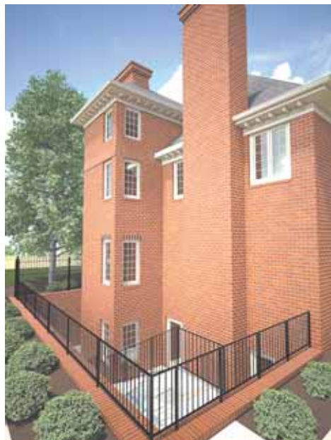
A McLean couple in their late-60s had Glickman design a 60-foot 4-level elevator tower on the home's right elevation. The tower will be re-clad in brick that matches the existing masonry and will not be visible from the front facade.