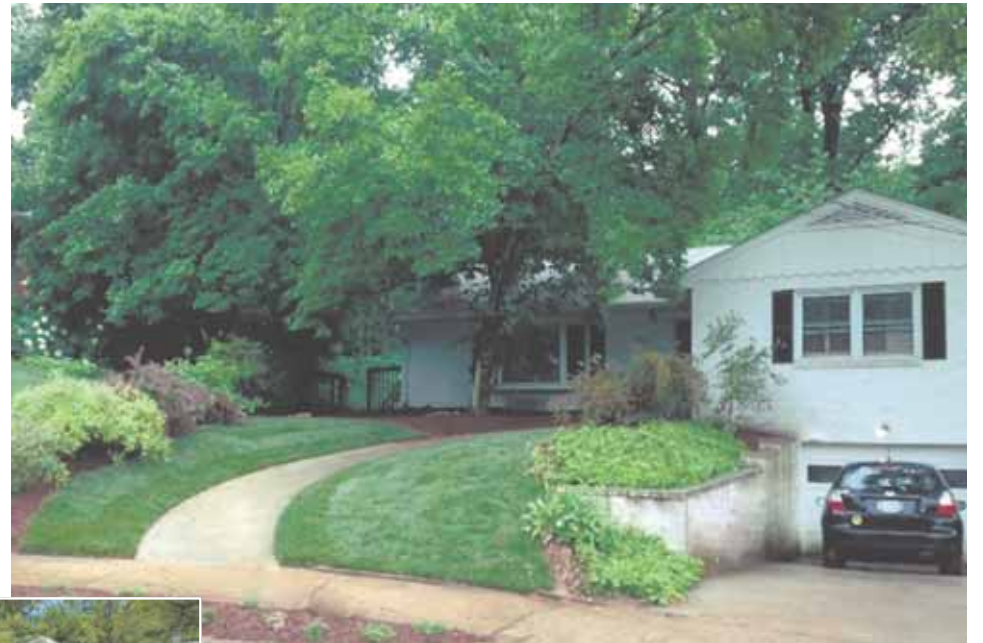
When Jaime Marquez began having difficulties getting from the house to the driveway, Glickman Design Build created a graduated front walk for the Arlington family. The new walk rises one inch per foot. The plan included replacing a front stoop with a "zero step" entry and widening interior doors and halls.

Also, she notes, the new front walk adds considerable curb appeal. "Honestly," she said, "I wish the walk had been in place when I was still pushing the girls in their stroller. It's just a lot easier for everyone."