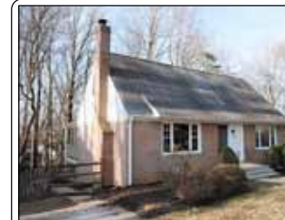
Fairfax Cape Cod Charm meets modern day living! Thanks to the designer who married the lovely qualities of a Cape Cod with today's style. Call to see this remodeled home which will hit the market shortly. 4 BRs, 3 FB, 3-level home with covered porch. Total square footage 2,500.

Mary Hovland 703-946-1775 Cathy DeLoach 571-276-9421 Your REALTORS® Next Door