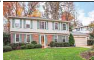
Annandale $624,999 Original owners have babied this home!! Many upgrades & updates thru-out. Gleaming hwd floors on main & upper levels. Stunning kitchen w/granite, SS appls, new cabinets & flooring. Main lvl fam rm w/frpl. Expansive sunroom addition off kitchen. Formal LR & DR. Five bedrooms up. Lower lvl boasts lg rec rm w/wet bar, storage & workshop. Replacement windows, siding, roof.