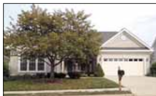
Gainesville Heritage Hunt 55+ $579,900 Spectacular golf crs & water view! 2 lvl Lakemont, 3BR, 3BA, Grnt Kit w isl & Corian, Fam rm off Kit, Gas Fpl, Liv, Din, Loft, 2 car Gar, Irrig syst.