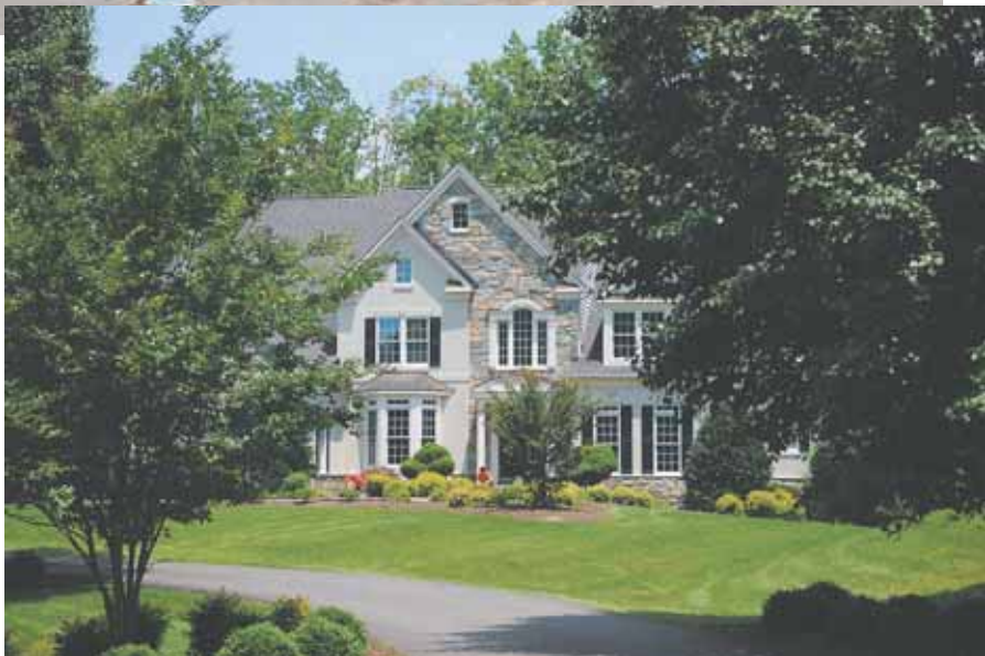
9 8168 Cottage Rose Court, Fairfax Station — $1,380,000