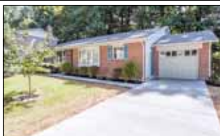
Fairfax Kings Park West $499,900 Updated 3-lvl beauty in sought-after KPW! 3BR, 2BA, Kit w/Corian cntns & ceramic tile, Brkfst rm, Din, Liv, updt BAs, MBR w/huge WIC, fresh paint, w/out LL w/Rec rm & Den, Lge flat yd, Gar, new driveway.