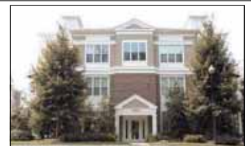
Herndon $249,900 Updated 3rd floor condo with almost 1000 sq. feet finished space. Hardwood floors in the living and dining room areas, upgraded kitchen, washer and dryer in unit. Walk to pool, weight room and club room. Minutes to Park and Ride on Monroe Street. New Metro coming in 2018.

Access the Realtors Multiple Listing Service: Go to www.searchvirginia.listingbook.com