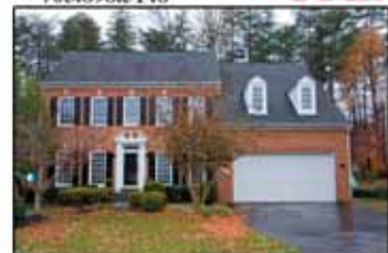
Fairfax - Private Setting - Ashton Village - $765,000

C.A.R.O.L. Hermendorfer Associates OPEN SUNDAY