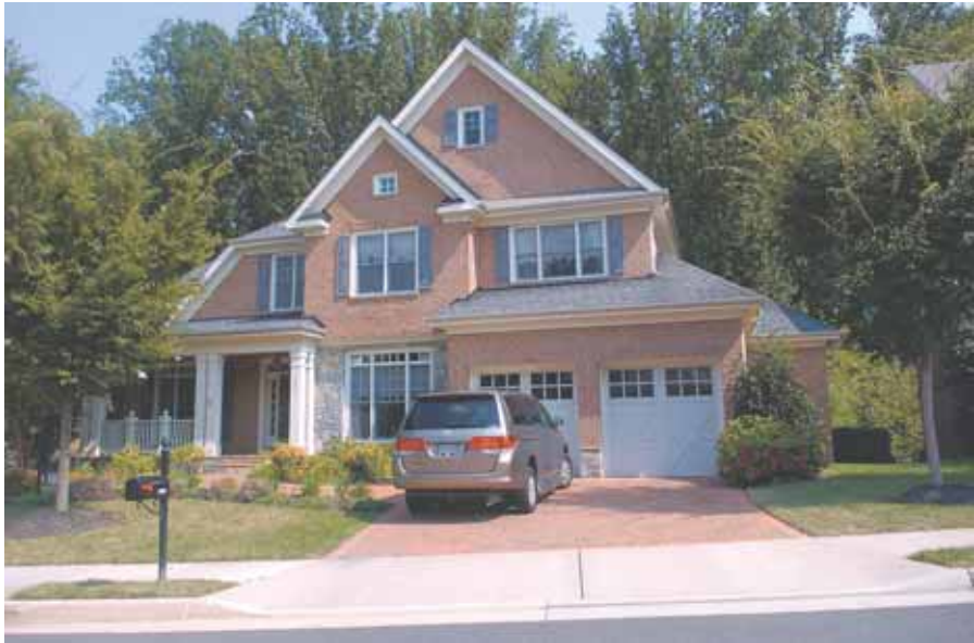
10 3555 Early Woodland Place, Fairfax — $1,325,000