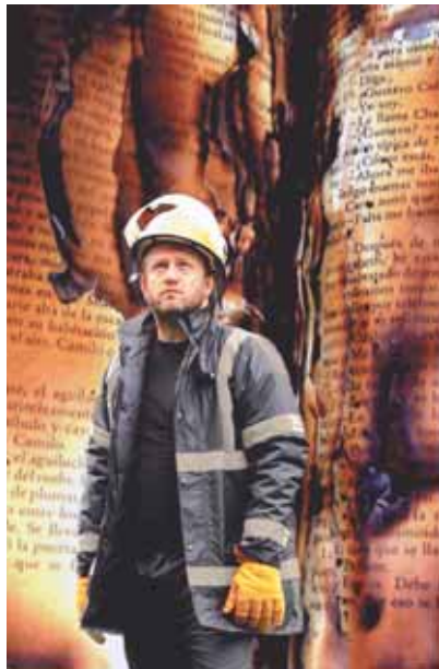
On Jan. 19, George Mason University's Center for the Arts is presenting "Fahrenheit 451" by science fiction and fantasy writer Ray Bradbury.

While written six decades ago, Bradbury conjured a world where "news" would be delivered to homes through "picture walls" long before the now