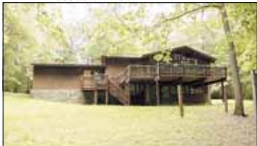
Clifton Deck house on gorgeous 5 acres with pond $595,000