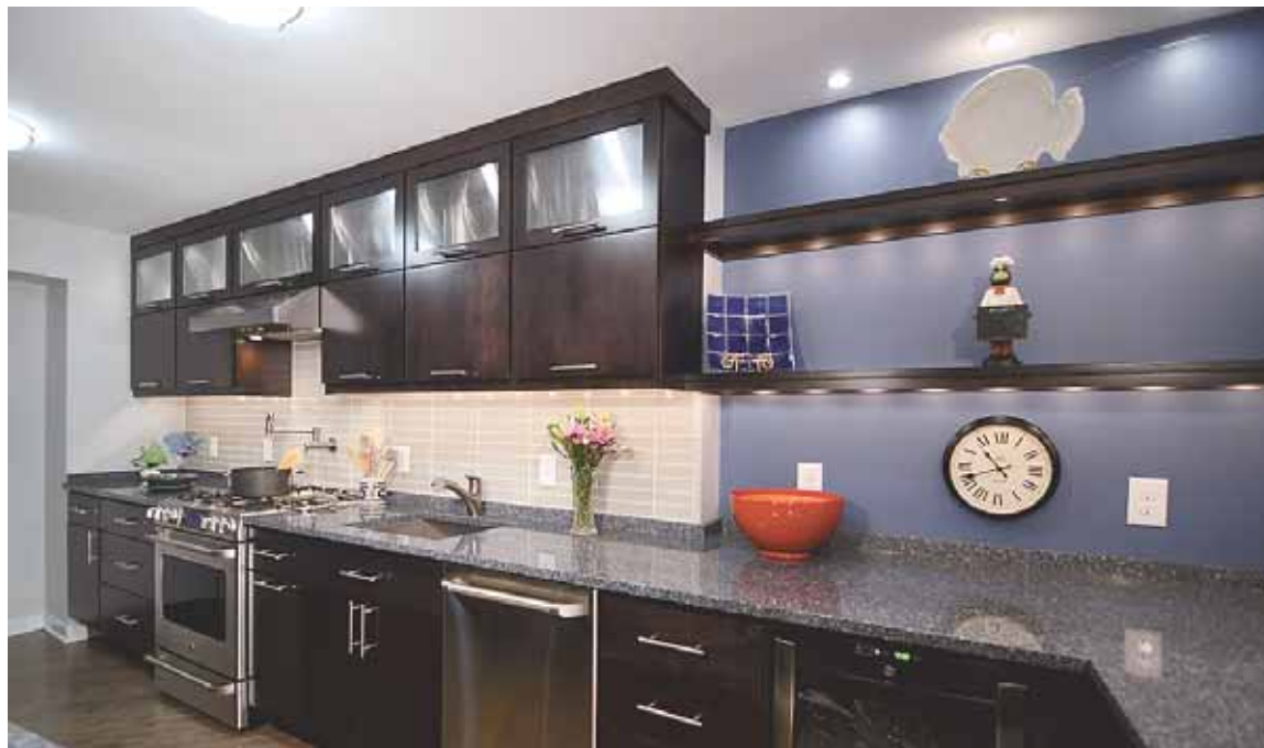
This kitchen by Case Design/Remodeling, Inc. was built with open shelving that offers extra storage as well as easy access to dinnerware.

racks that hang from walls and doors. "[They are] very functional and I've used them many times in kitchens and other rooms," she said. "It is not unattractive, but [it's] not a 'pretty' organizing item."