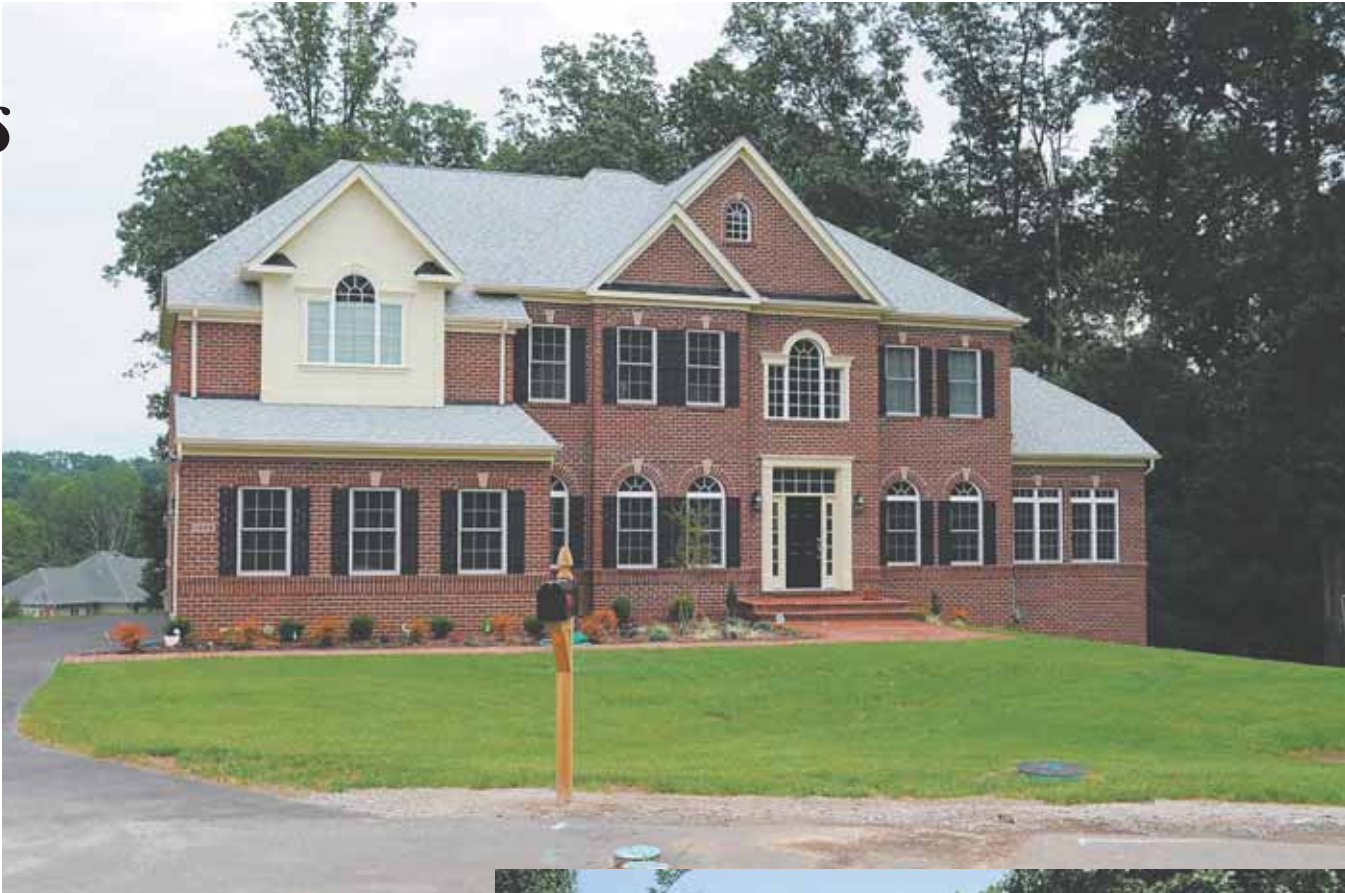
2 11390 Amber Hills Court, Fairfax — $1,582,924