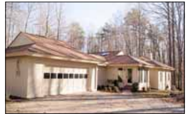
Fairfax Station $699,000 Privacy abounds in this one level, sun filled contemporary! Five private acres, walls of glass, soaring ceilings, 3 bedrooms, 2.5 baths, sunroom and more! 7815 Willowbrook Dr.