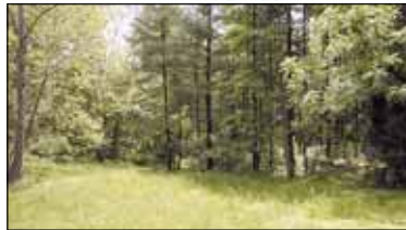
Clifton Adjoining buildable 5 acres can be sold with the Deck house $450,000

View more photos at www.hermendorfer.com