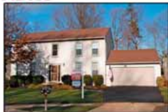
Burke Centre - Great Lot, Updated, Screened in Porch, Call for Price!

View more photos at www.hermendorfer.com .