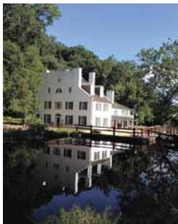
The Tavern at Great Falls in the C&O National Historical Park.

Potomac Community Center is Montgomery County's busiest community center, with open gym activities, arts and crafts, exercise classes, leisure classes, group support meetings and socials, senior adult activities, sports programs, summer camps, programs for individuals with disabilities, children's holiday parties, volunteer opportunities and more. Fa-