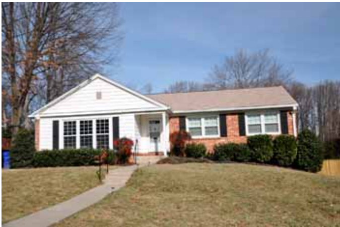
2 8109 Whites Ford Way — $661,000