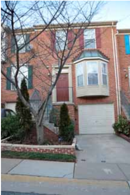
6 13616 Hayworth Drive — $490,000