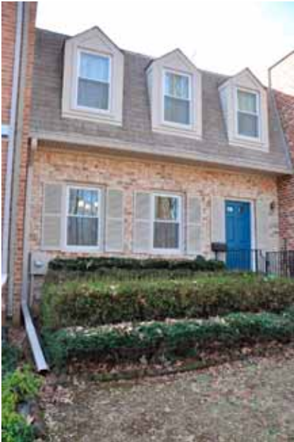
5 7705 Heatherton Lane — $516,500