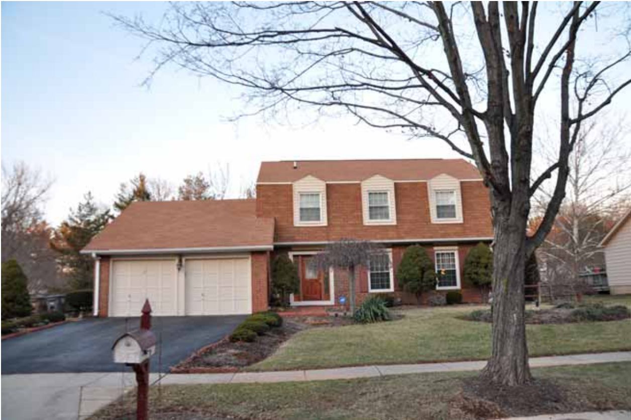
1 1735 Glastonberry Road — $690,000

IN NOVEMBER 2013, 34 POTOMAC HOMES SOLD BETWEEN $2,800,000-$490,000.