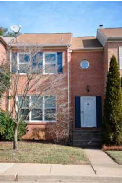
3 7832 Heatherton Lane — $565,000

COPYRIGHT 2013 REAL ESTATE BUSINESS INTELLIGENCE. SOURCE: MRIS AS OF DECEMBER 13, 2013.