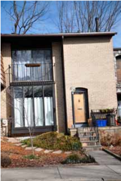
4 8178 Inverness Ridge Road — $529,000