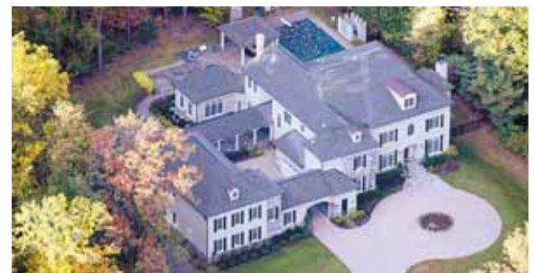
Great Falls $4,499,999