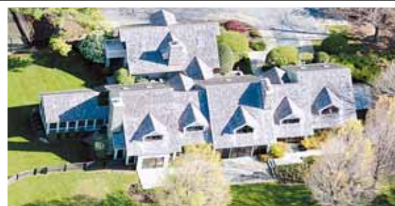
Great Falls $2,495,000