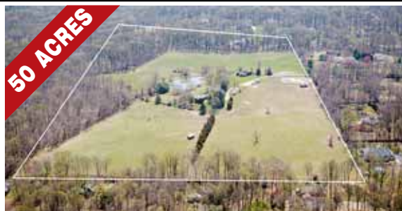
Great Falls $13,500,000