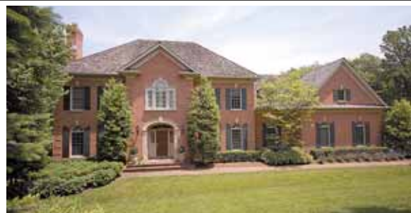
Great Falls $2,099,000