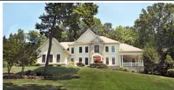
Great Falls $1,799,000