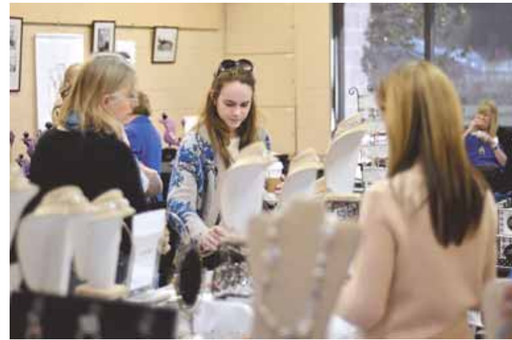
Visitors to the McLean Community Center could view the artwork and design of more than 40 artists at the February jewelry showcase.