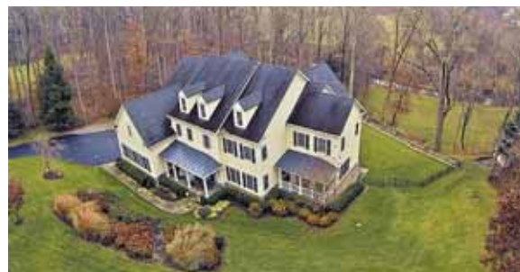
Great Falls $2,495,000