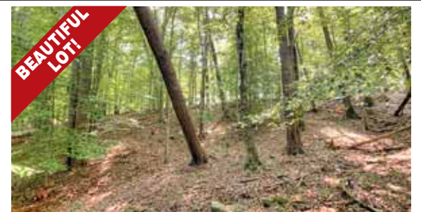
Great Falls $725,000