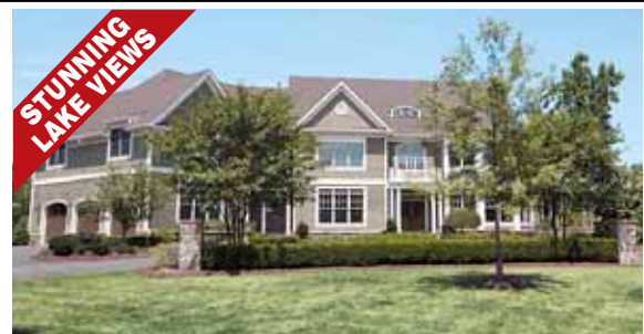
Great Falls $2,495,000