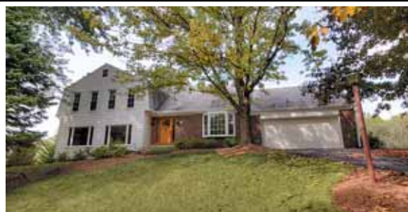
Great Falls $895,000