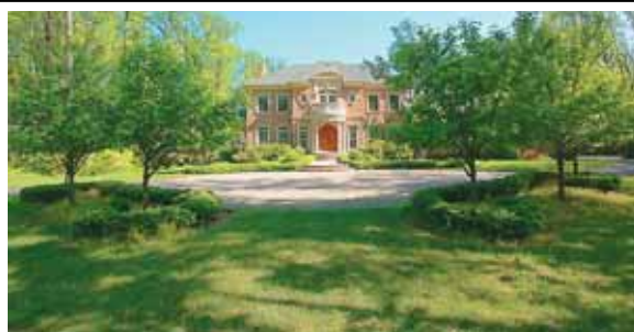
Great Falls $2,995,000