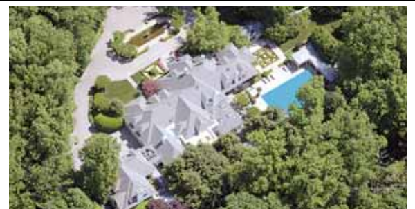
Great Falls $5,995,000