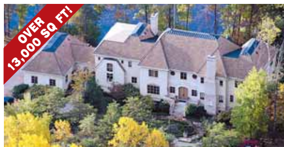
Great Falls $3,148,880