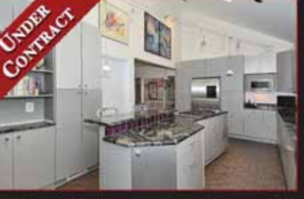
720 Clear Spring Rd., Great Falls 11124 Rich Meadow Dr., Great Falls $1,099,000