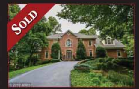
501 Seneca Knoll Ct., Great Falls $1,587,000