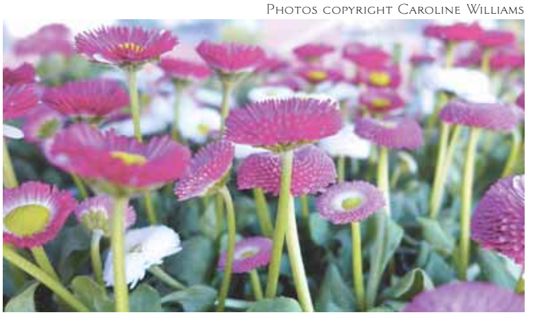
English daisies add bright bursts of color to spring gardens.

damage this year. "Deer didn't have much to eat except for plants like azaleas and rhododendrons." Insect damage is less obvious