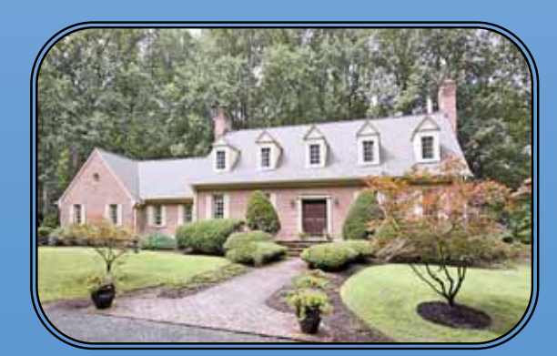
Springvale RD, Great Falls $1,499,000