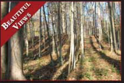
Springvale Rd., Great Falls 3.48 Acre Lot $680,000