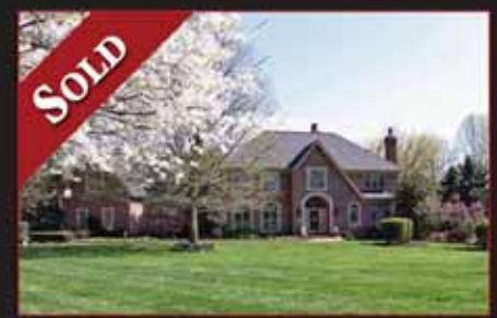
505 Seneca Knoll Ct., Great Falls $1,422,500