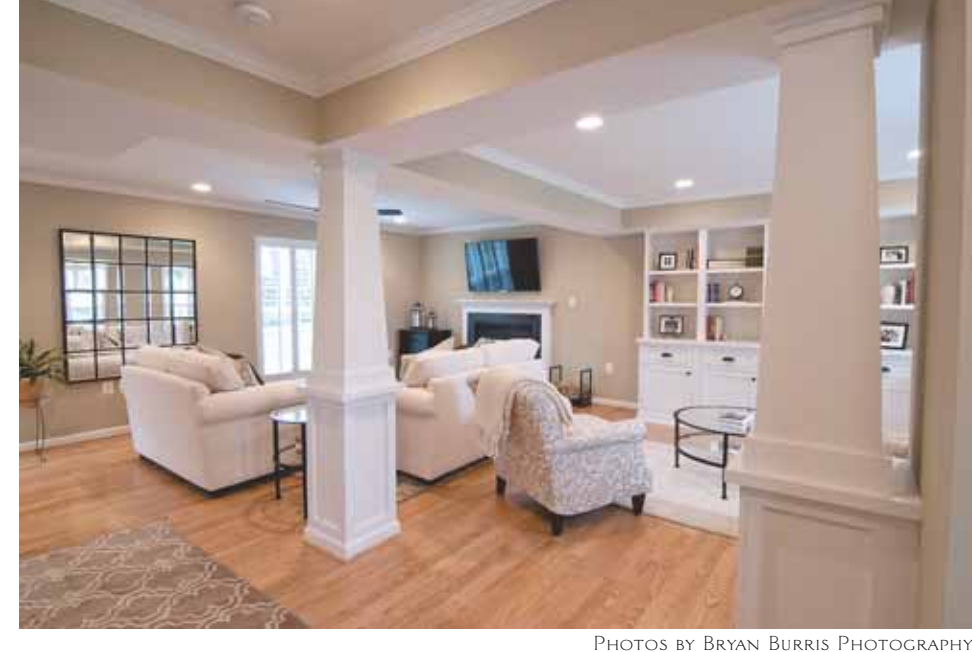
To differentiate the front-facing library from the family room visually, Sun Design converted existing overhead beams into an elegant tray ceiling supported by Craftsman-style piers.

makeover's lead designer, proved a revelation from the start. A veteran home remodeling specialist as well as a nationally recognized furniture designer, Benson's input shaped a floor plan focused on personal requirements in which custom built-ins eliminate unneeded walls while sharply improving both room function and interior design integrity.