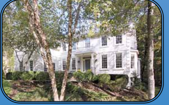
SHERLIN LN, GREAT FALLS $1,150,000