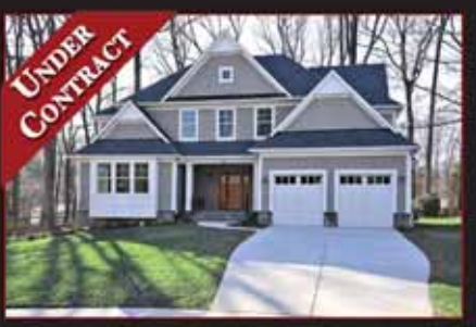
1121 Kelley St., Vienna $1,399,000