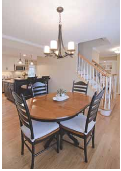
The new transitional-style interior employs decorative elements to create distinctive use-zones in an open floor plan.