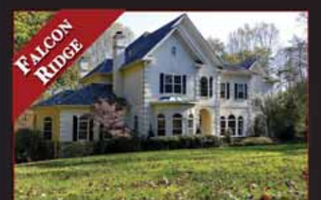
10100 Harewood Ct., Great Falls $1,799,000