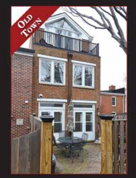
805 Wolfe St., Alexandria $1,249,000