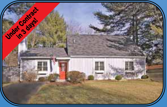
GREAT MEADOW DR, RESTON $510,000