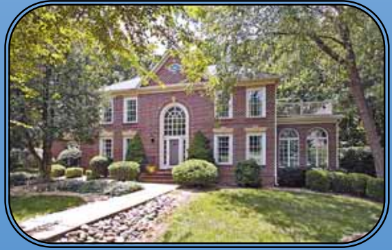
Bowen, Great Falls $1,049,000