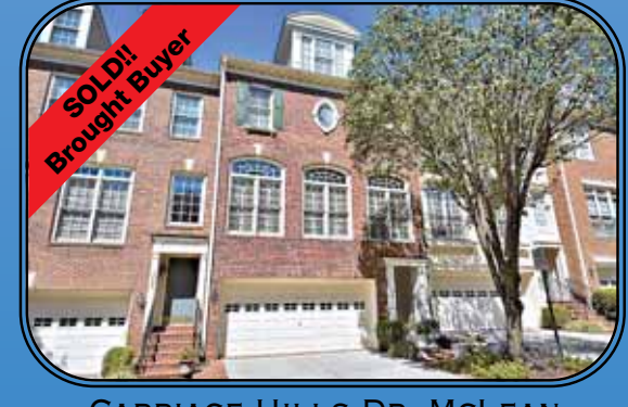
Carriage Hills Dr, McLean $830,000

ETRISTIE'S EXTRAORDINARY #1 Seller of Luxury Homes Long & Foster Real Estate, Inc. 9841 Georgetown Pike, Great Falls, VA 22066 • 703-759-9190