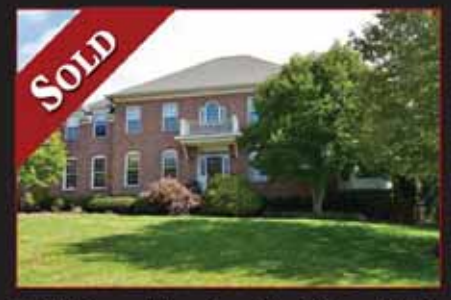
1195 Lees Meadow Ct., Great Falls $1,500,000