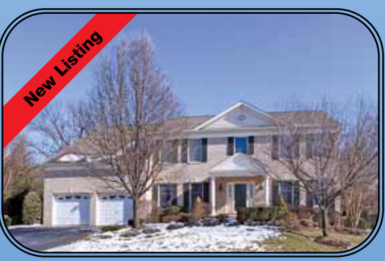
Autumn Crest, Oak Hill $965,000