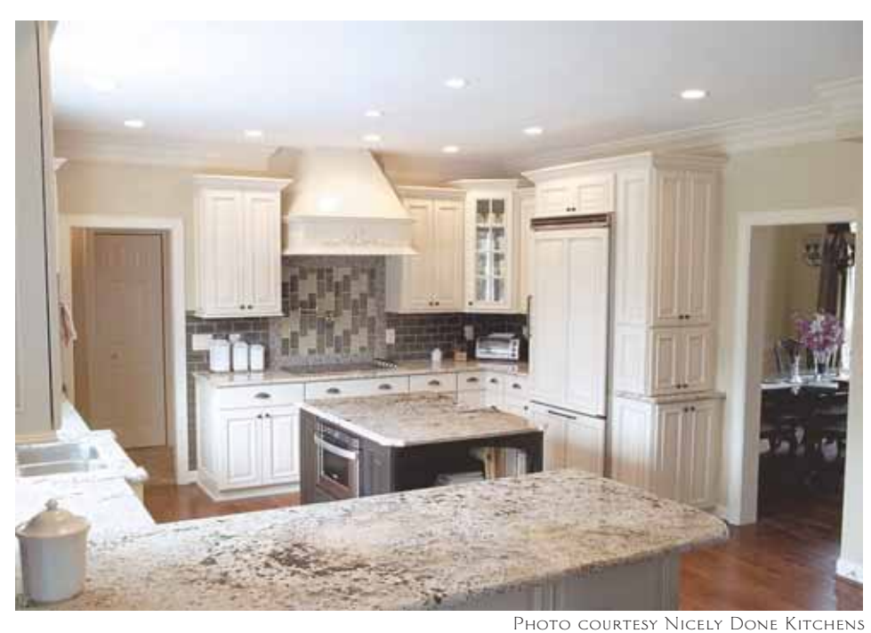
A vertical, glass subway tile backsplash adds a dramatic flair to this kitchen by Nicely Done Kitchens.

At nearly 85 percent job completion, client decided they wanted to completely remove the wall between the kitchen and family room. In the original design, we partially removed the wall," said Mann. "This meant a shift and redirection of scope, additional engineering [because] the remaining por-