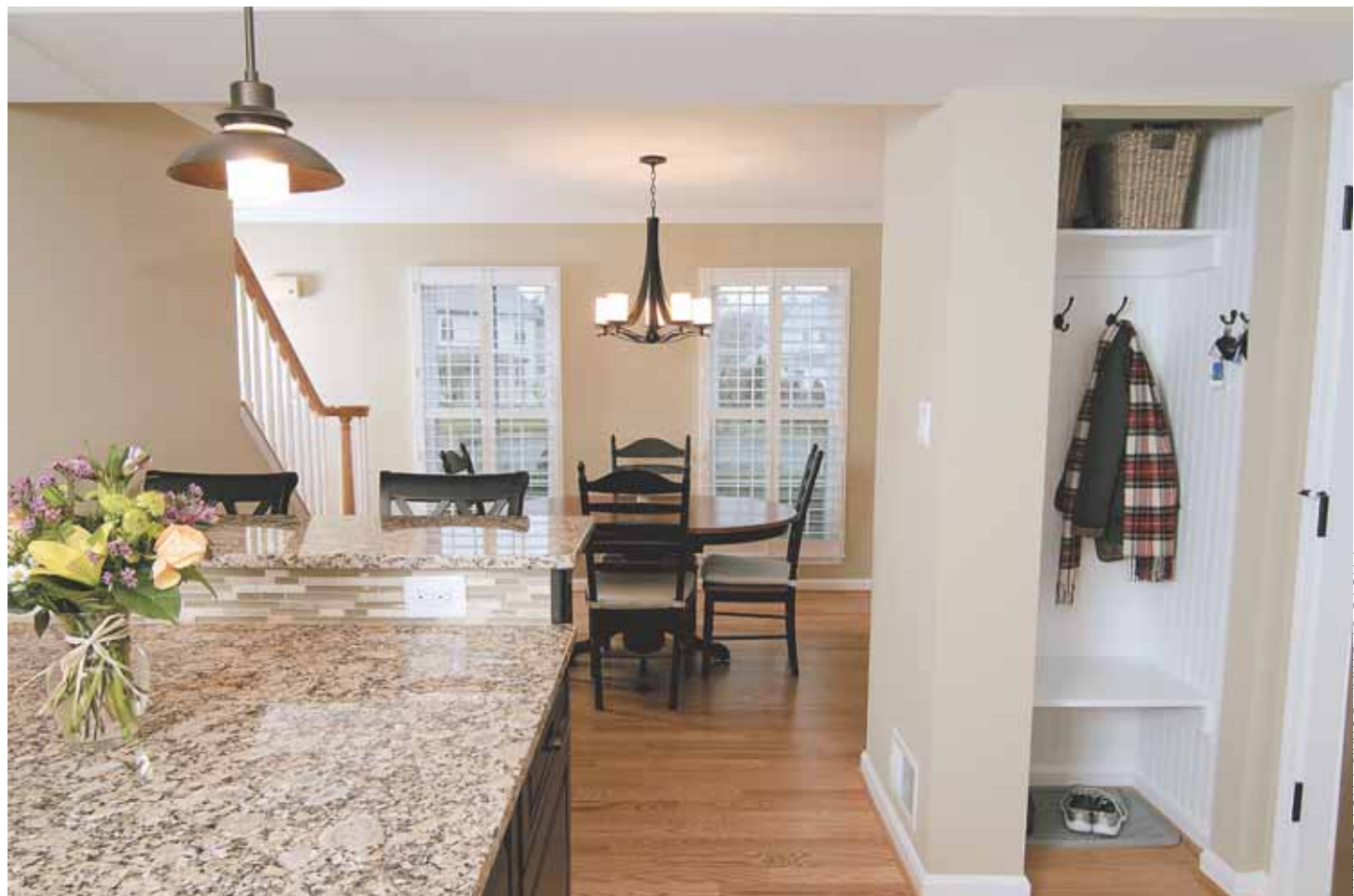
By borrowing a mere nine square feet from the dining room, the designers found space for a small mudroom with bench immediately to the right of a side kitchen door.

At just over 800 square feet, the home's primary living area had been serviceable enough; even so, the formal dining room and adjacent den on opposite sides of the front facing foyer were hardly ever used and the rear family room was dark and cramped.