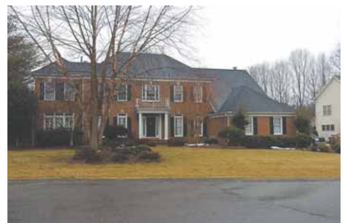
6 6471 Lake Meadow Drive, Burke — $1,037,500