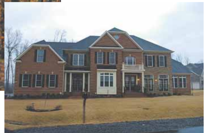
2 11394 Amber Hills Court, Fairfax — $1,626,036