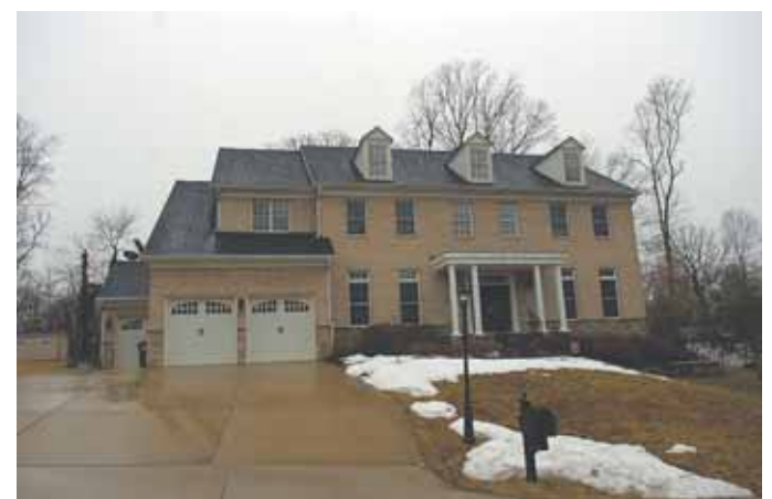
5 7111 Granberry Way, Springfield — $1,060,000