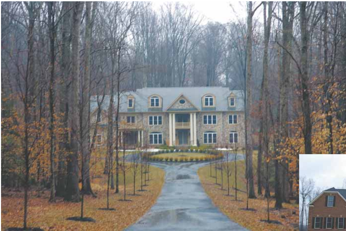
1 7540 Clifton Road, Fairfax Station — $2,250,000