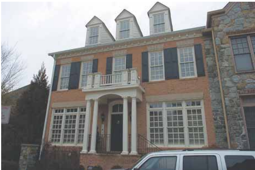
2 1418 Harvest Crossing Drive, McLean — $1,850,000