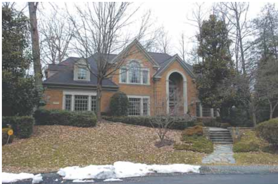
1 8419 Brookewood Court, McLean — $2,198,800