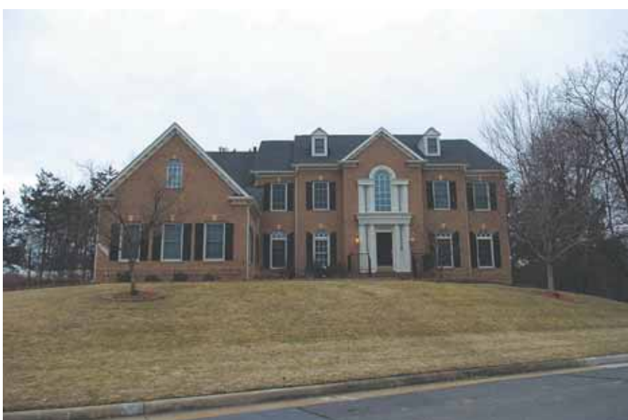
4 8500 Stony Point Court, McLean — $1,660,000