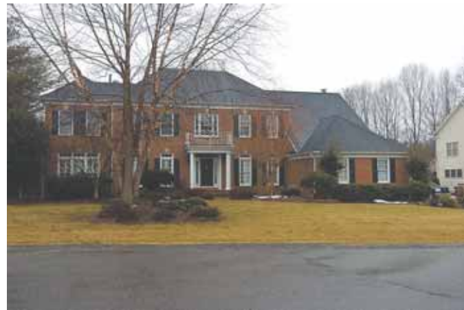
6 6471 Lake Meadow Drive, Burke — $1,037,500