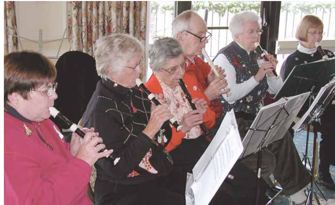
Members of the Osher Lifelong Learning Institute (OLLI) at George Mason University play music for their peers. Below, other members listen to a lecture.