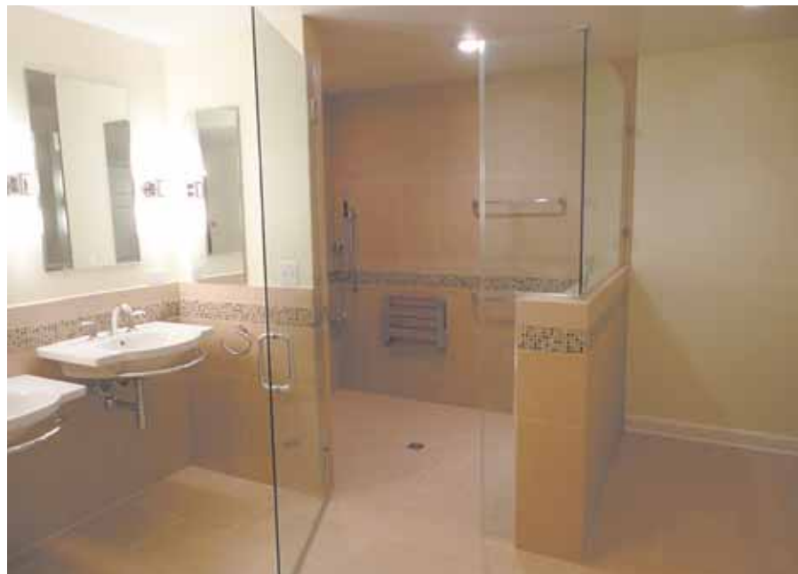
The curbless roll-in shower was designed for wheel-chair access.