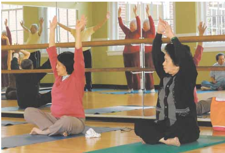
Arlington seniors take a hatha yoga classes. A recent study showed yoga programs specifically designed for seniors can improve strength and flexibility.