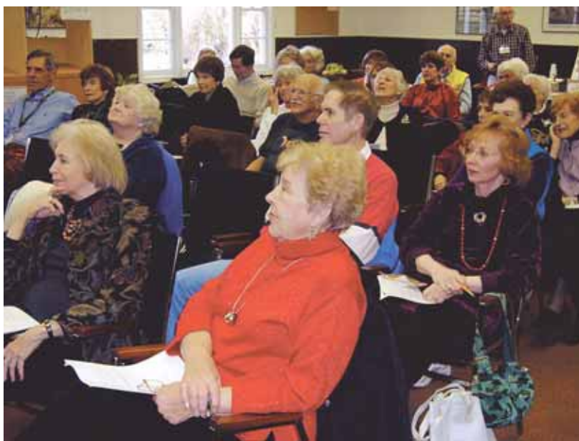
“Professors volunteer their time to give lectures on art, history, science and other topics.”