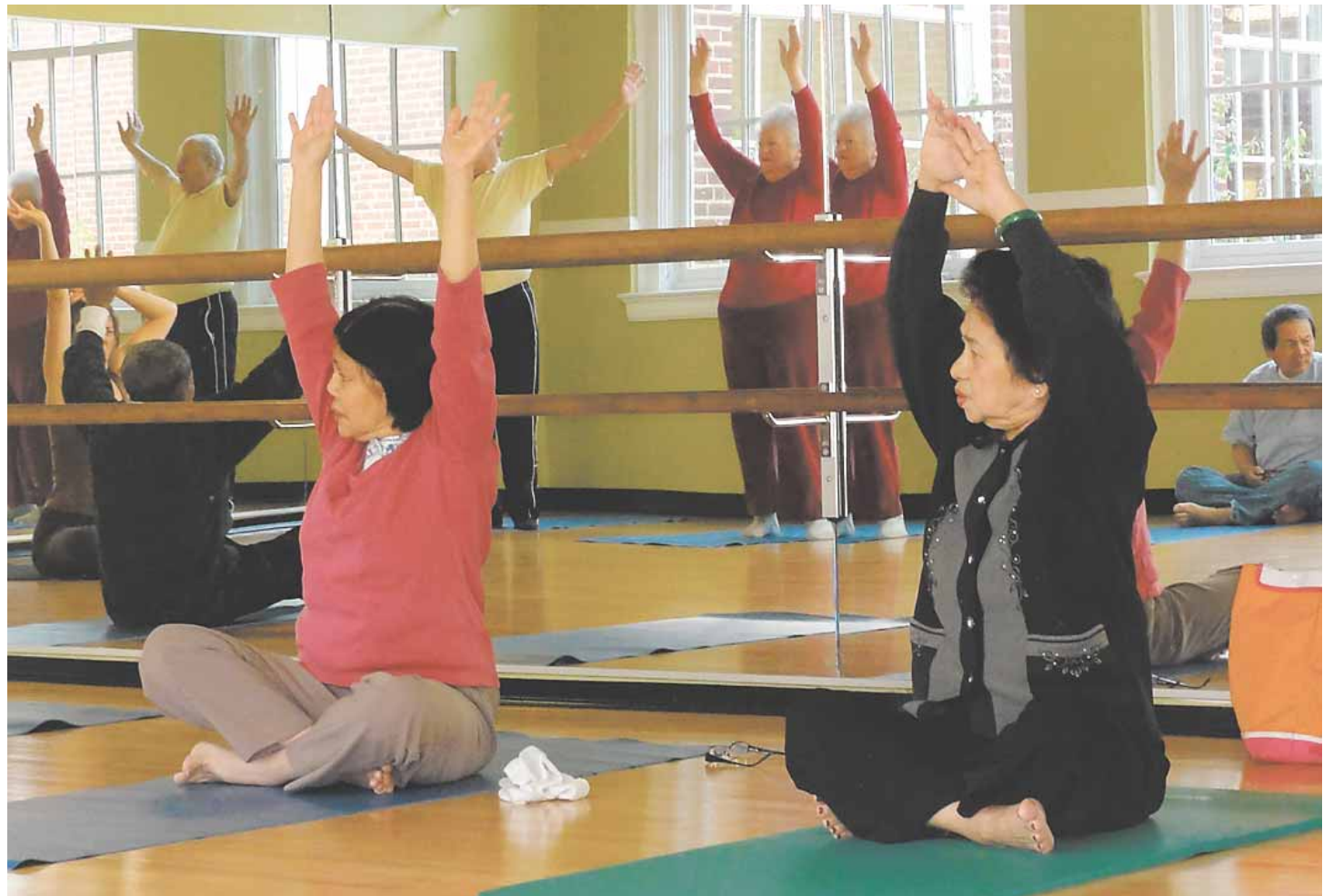
Arlington seniors take a hatha yoga classes. A recent study showed yoga programs specifically designed for seniors can improve strength and flexibility.

“That is baby boomers going into yoga,” she said. “Yoga for seniors is going to be