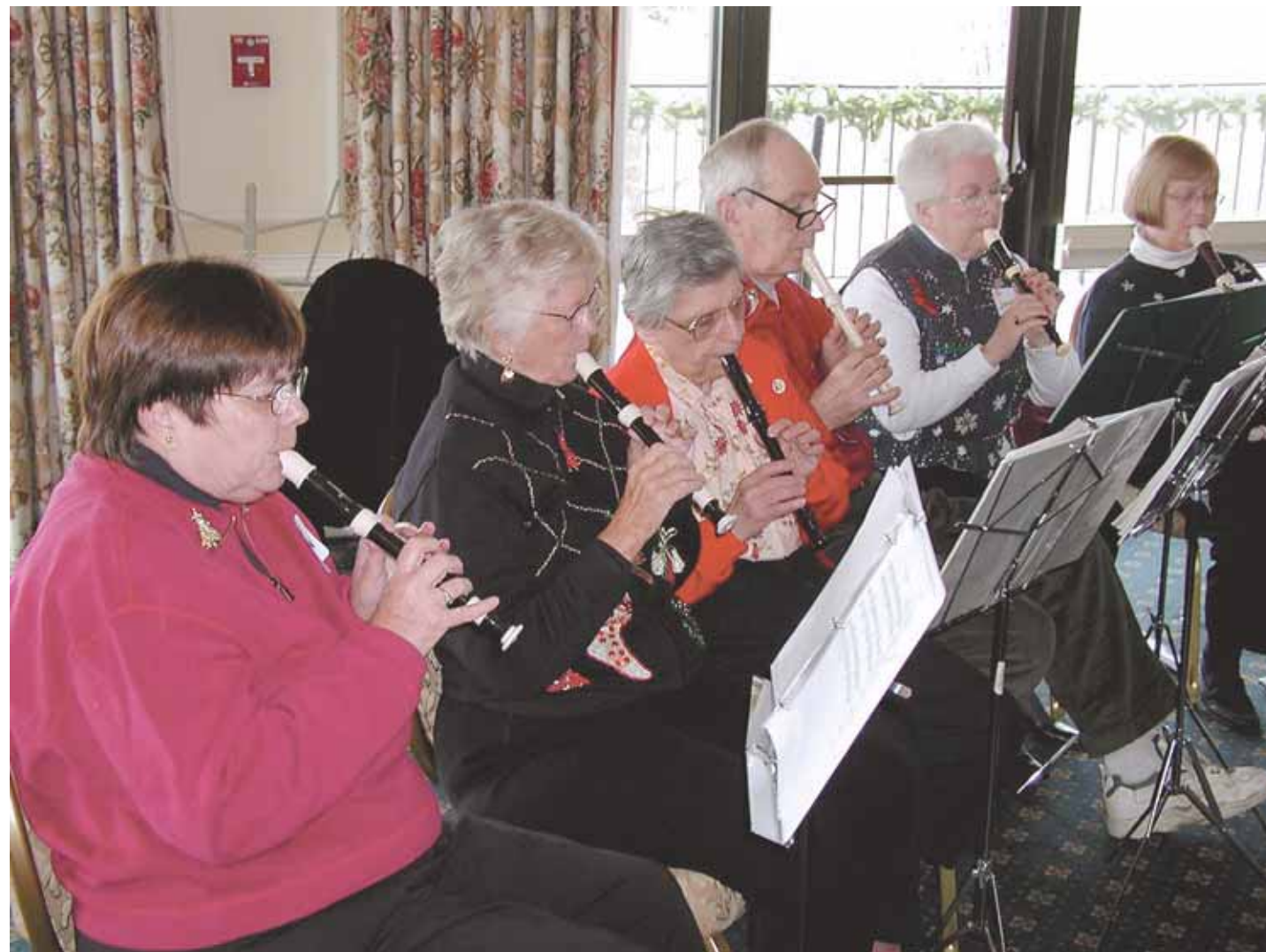
Members of the Osher Lifelong Learning Institute (OLLI) at George Mason University play music for their peers. Below, other members listen to a lecture.