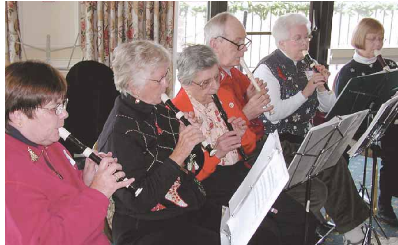
Members of the Osher Lifelong Learning Institute (OLLI) at George Mason University play music for their peers. Below, other members listen to a lecture.