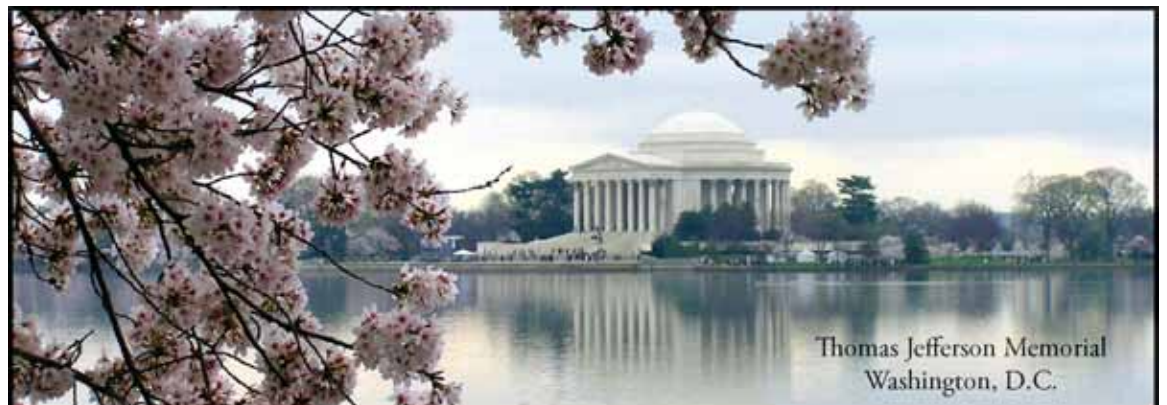
Thomas Jefferson Memorial Washington, D.C.