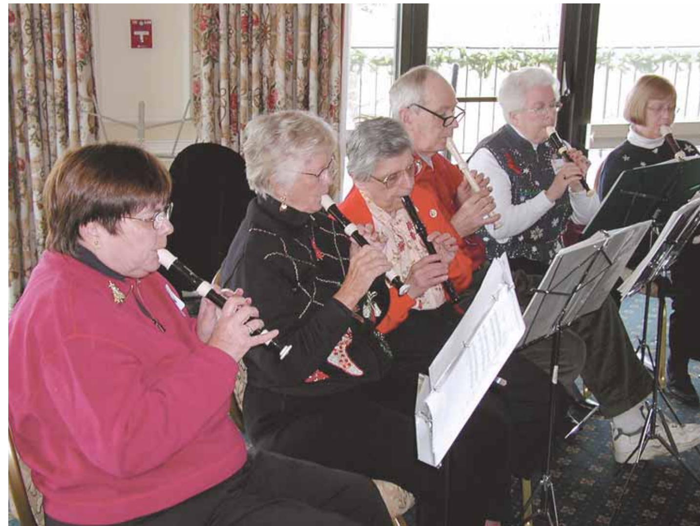
Members of the Osher Lifelong Learning Institute (OLLI) at George Mason University play music for their peers. Below, other members listen to a lecture.