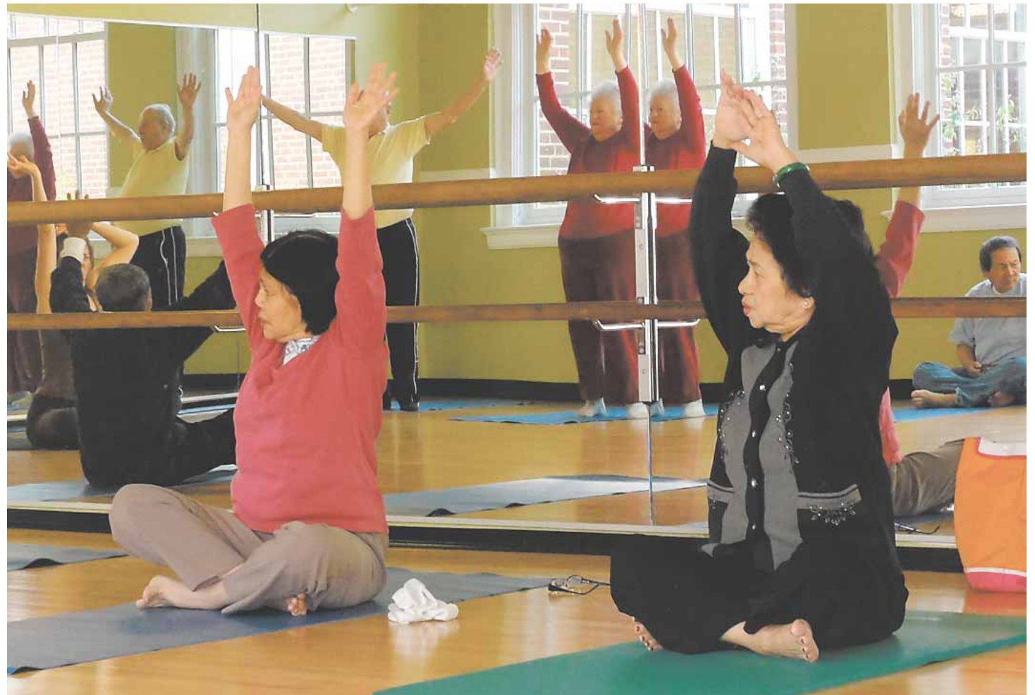
Arlington seniors take a hatha yoga classes. A recent study showed yoga programs specifically designed for seniors can improve strength and flexibility.

“That is baby boomers going into yoga,” she said. “Yoga for seniors is going to be