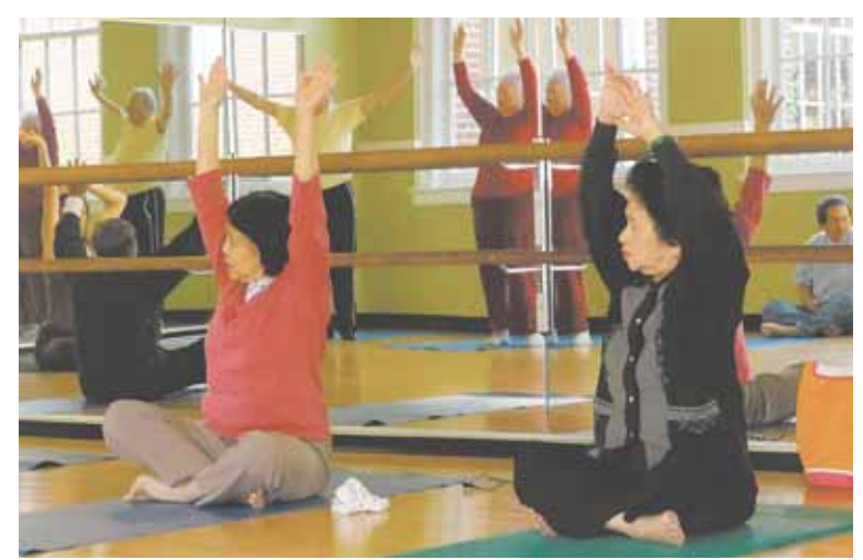
A recent study showed yoga programs specifically designed for seniors can improve strength and flexibility.