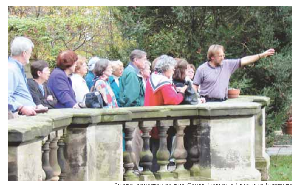
Members of the Osher Lifelong Learning Institute (OLLI) at George Mason University take an educational field trip. Opportunities for socializing and learning are important as one ages.

tion on Aging, the population 65 years or older numbered 39.6 million in 2009. By 2030, that number will grow to about 72.1 million.