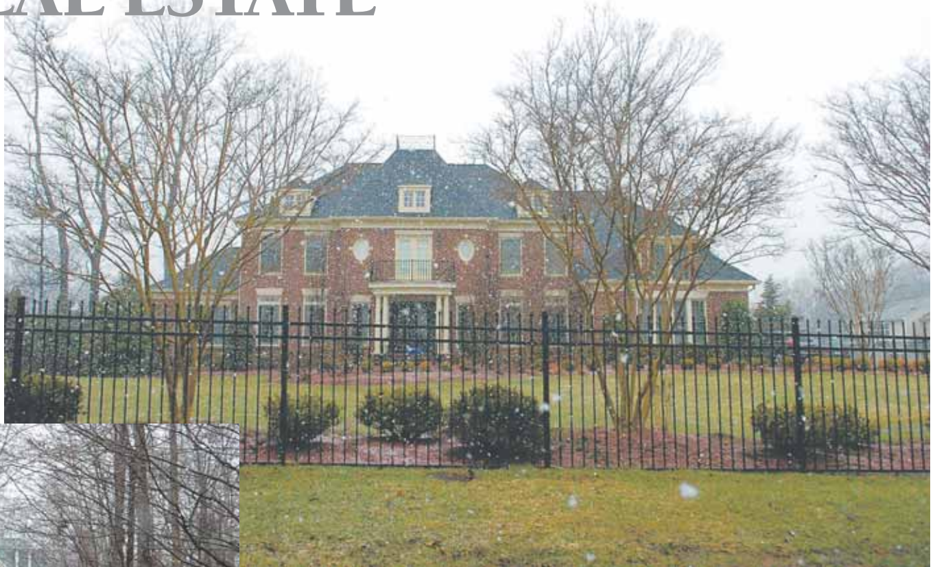
1 3802 Millard Way, Fairfax — $1,700,000