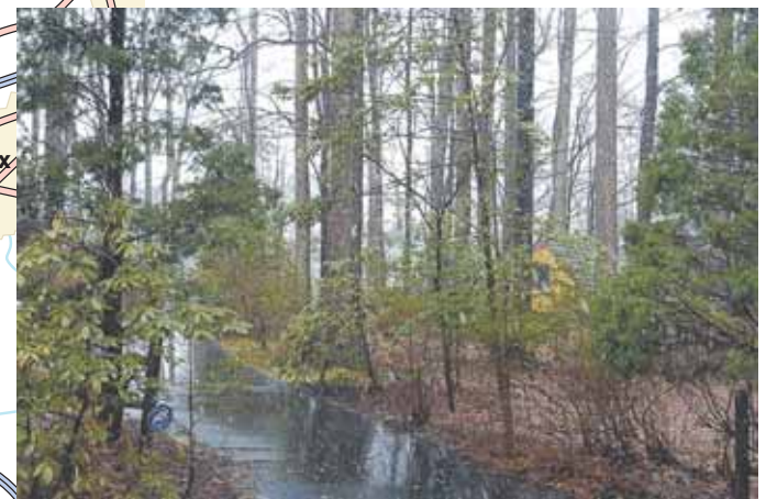
6 11418 Liltling Lane, Fairfax Station — $1,165,000