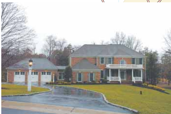
9 16700 Cedar Post Court, Centreville — $1,045,000