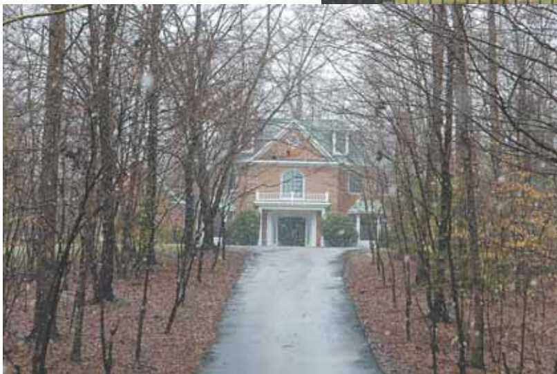
3 7840 Gold Flint Drive, Clifton — $1,237,522