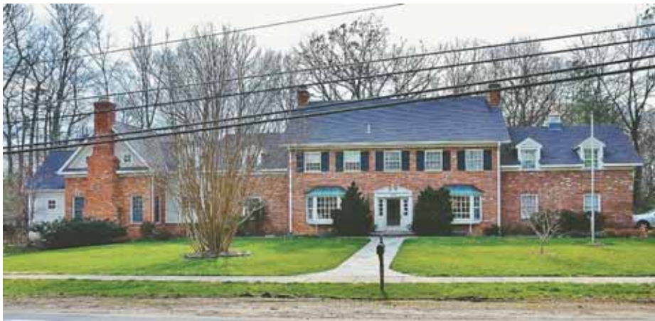
3 9300 Old Mount Vernon Road — $1,250,000