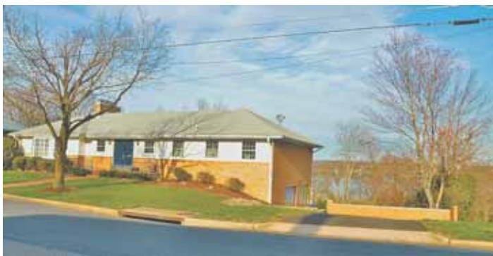
5 7301 Park Terrace Drive — $1,125,000