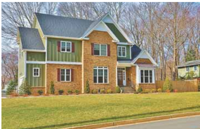
6 8911 Charles Augustine Drive — $1,017,500