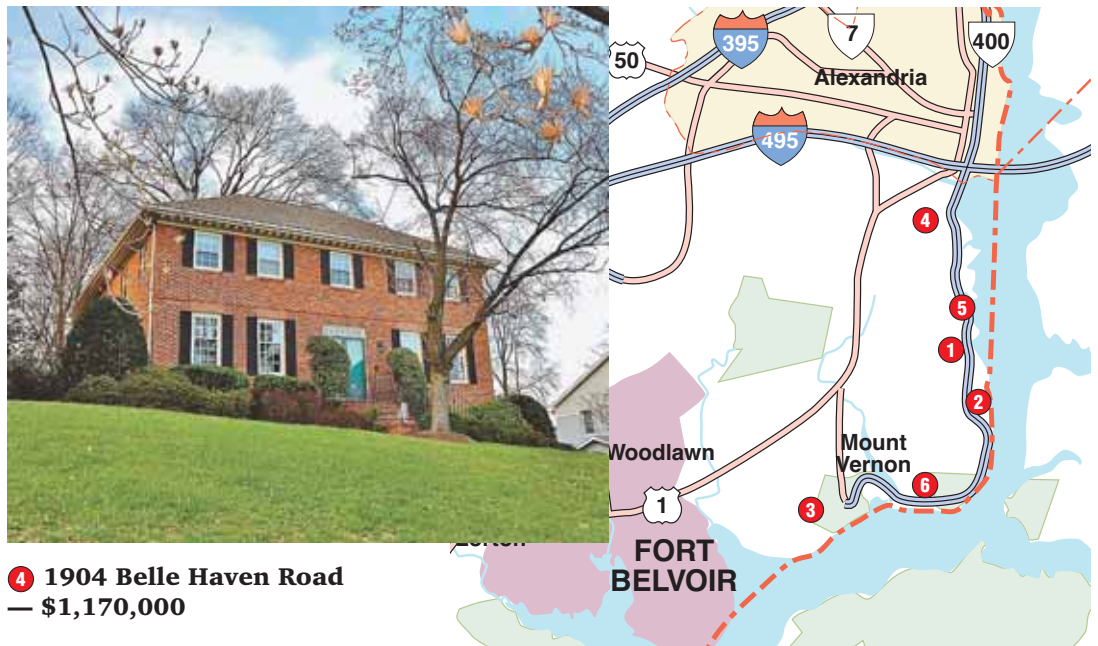
4 1904 Belle Haven Road — $1,170,000