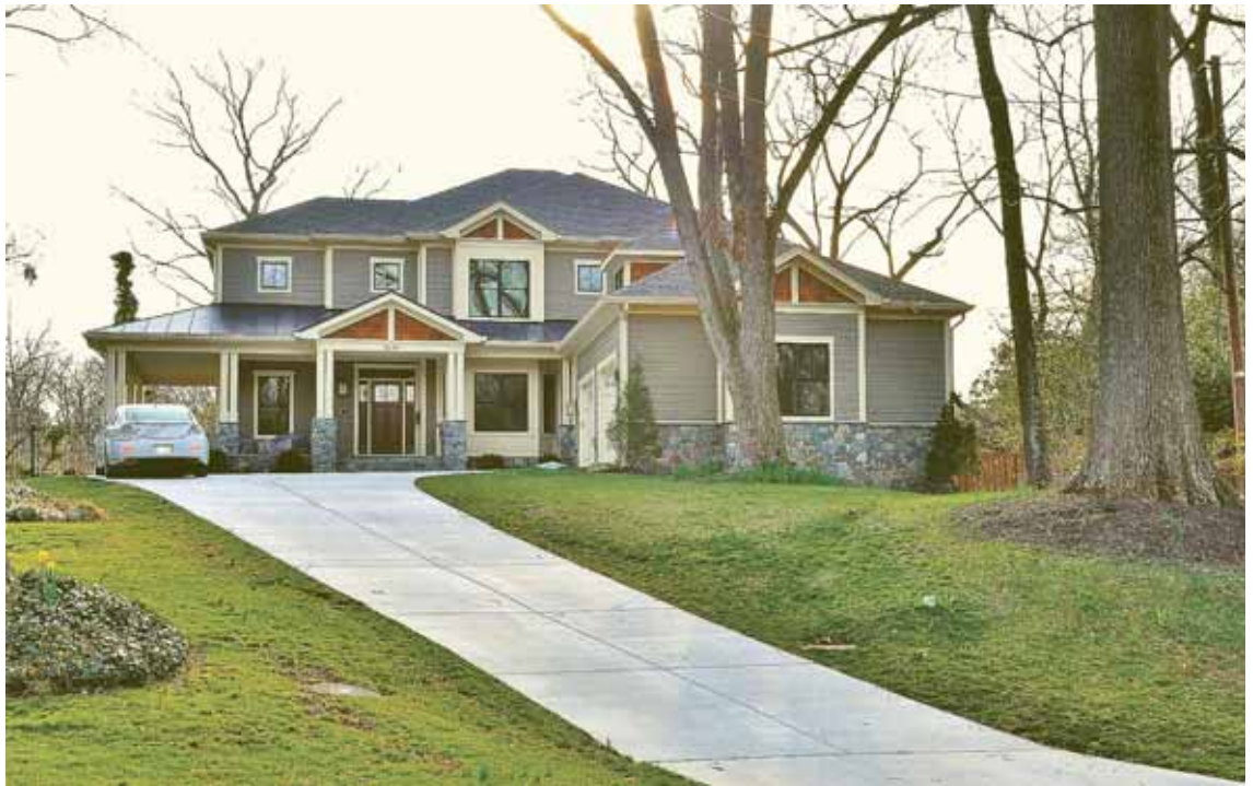
1 7612 Holiday Drive — $1,435,000

IN FEBRUARY 2014, 99 HOMES SOLD BETWEEN $1,435,000-$117,800 IN THE MOUNT VERNON AREA.