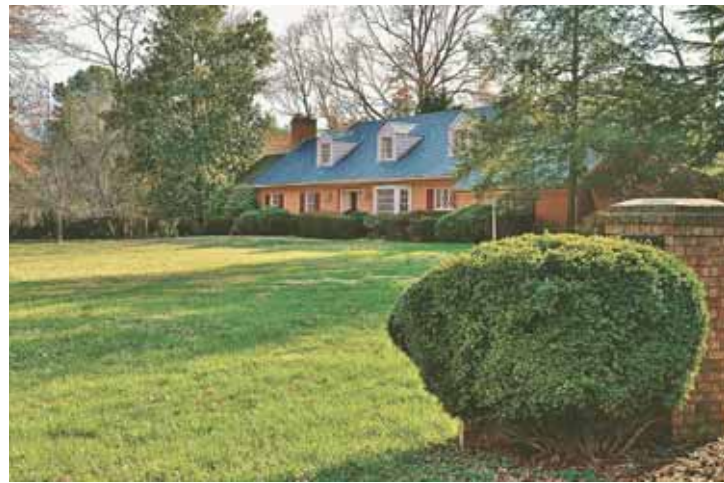
2 8110 Boulevard Drive East — $1,250,000