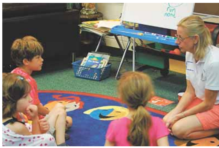
St. Stephen's & St. Agnes School's Lower School Academic Enrichment Camp