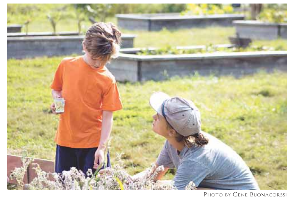
Arcadia runs a camp where children from 6-11 years old get to experience life on a farm and learn about the source of their food.

She is passionate when she talks about her mission to ensure that all children are able to attend a camp where they are safely immersed in the outdoors. "This camp counteracts nature deficit disorder," she said. "There are no electronics. The children are