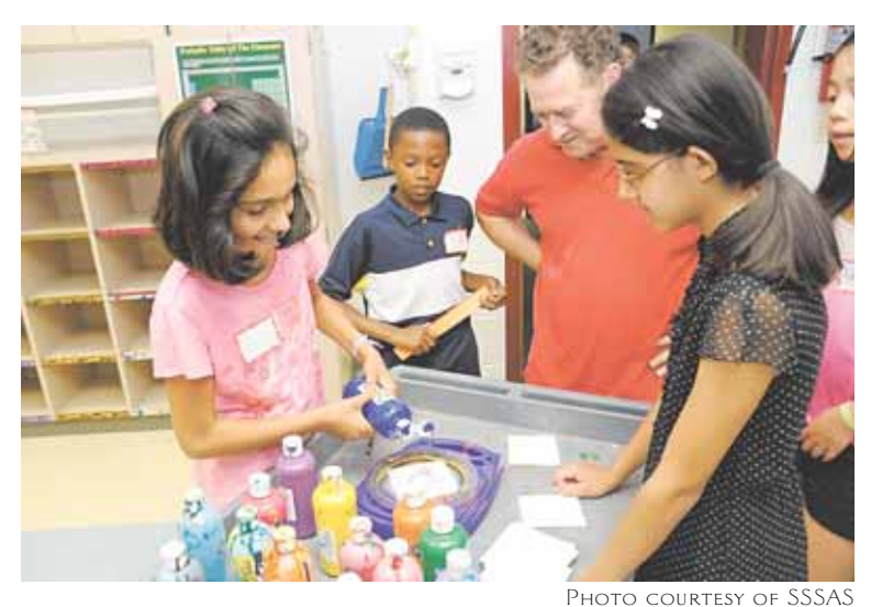
St. Stephen's & St. Agnes School's Physics is Fun! Camp