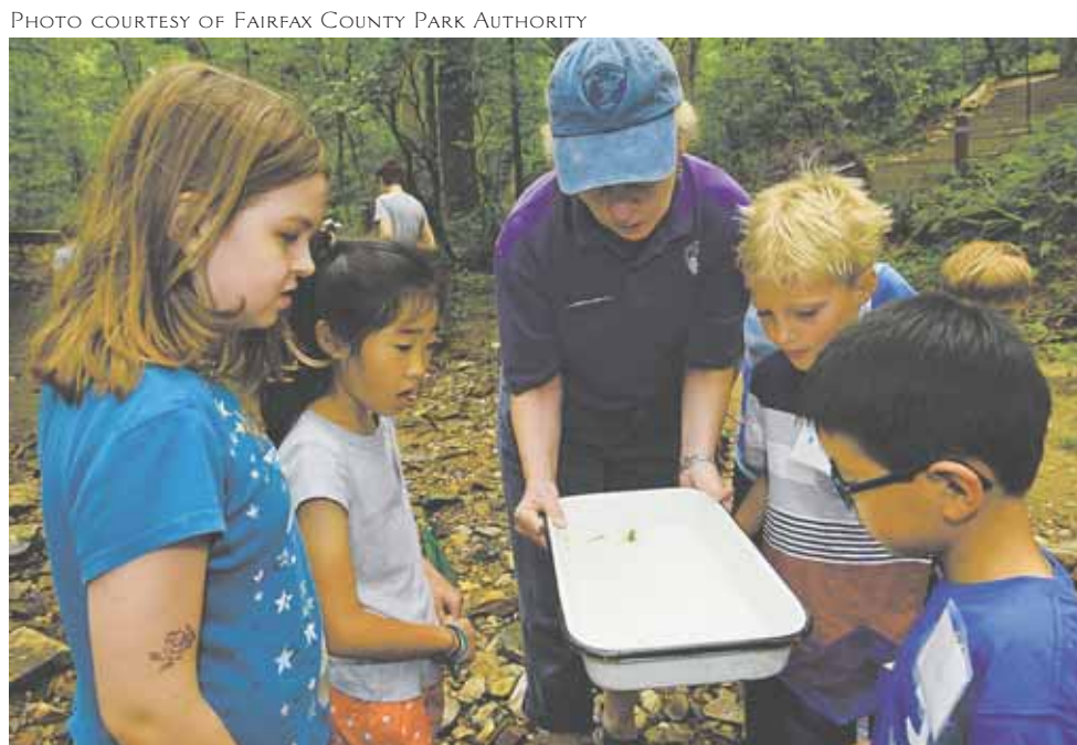
Campers at Hidden Oaks Nature Center marvel at a crayfish they netted.