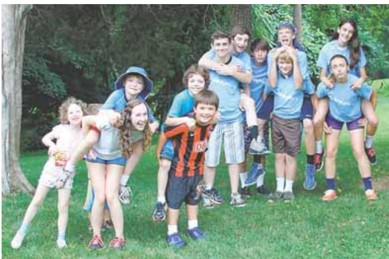
MADEIRA SCHOOLS PHOTO