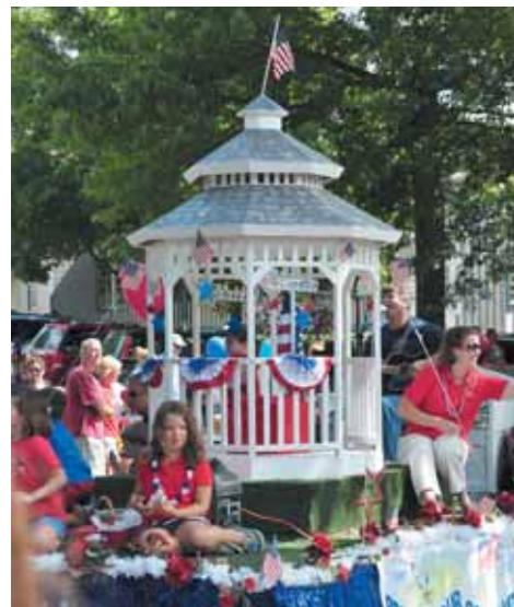
A float with a Great Falls gazebo replica participates in the annual Fourth of July parade last year.