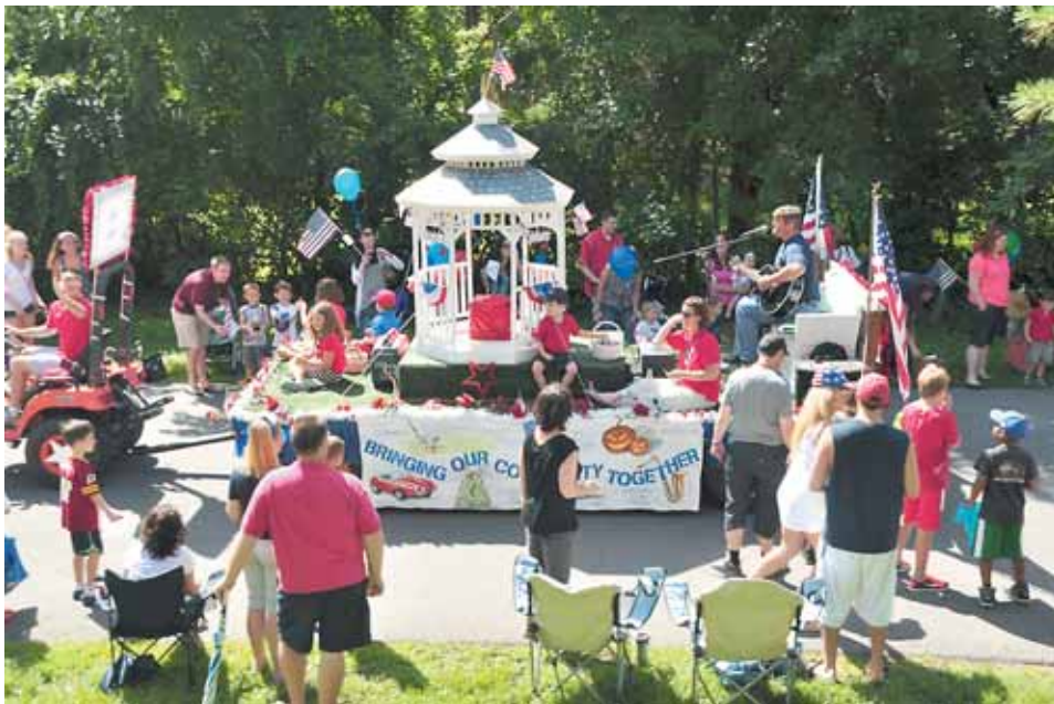
The Celebrate Great Falls float makes its way down Columbine Street during the annual Great Falls Fourth of July parade last year.