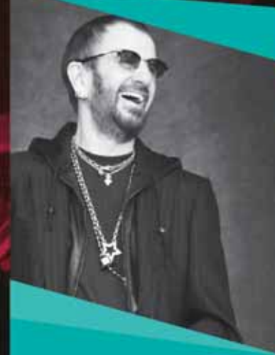
RINGO STARR & HIS ALL-STARR BAND Steve Lukather, Todd Rundgren, Gregg Rolie, Richard Page, Mark Rivera, and Gregg Bissonette JUNE 12