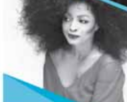
DIANA ROSS JUNE 29