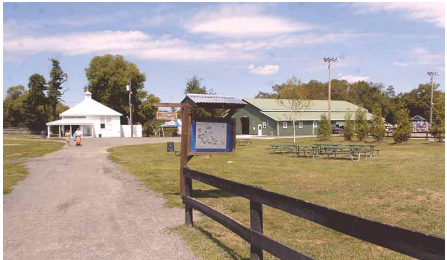
Frying Pan Farm Park

Bull Run Marina , located on the waters of the Occoquan Reservoir, is part of the Northern Virginia Regional Park Authority's 5,000 acres of preserved Bull Run-Occoquan Stream Valley land. The water at this location offers opportunities