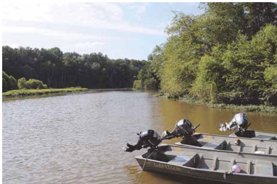
Bull Run Marina offers fishing and boating.