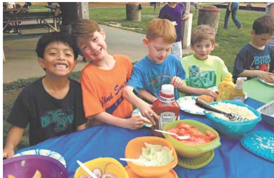
Mother-Son Picnic at Fairfax's Van Dyck Park

Fairfax CONNECTION Summer Fun Food Arts Entertainment