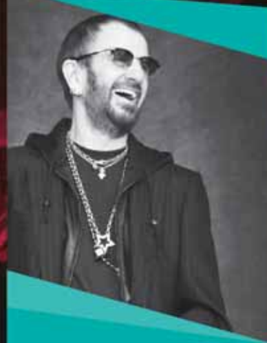
RINGO STARR & HIS ALL-STARR BAND Steve Lukather, Todd Rundgren, Gregg Rolie, Richard Page, Mark Rivera, and Gregg Bissonette JUNE 12