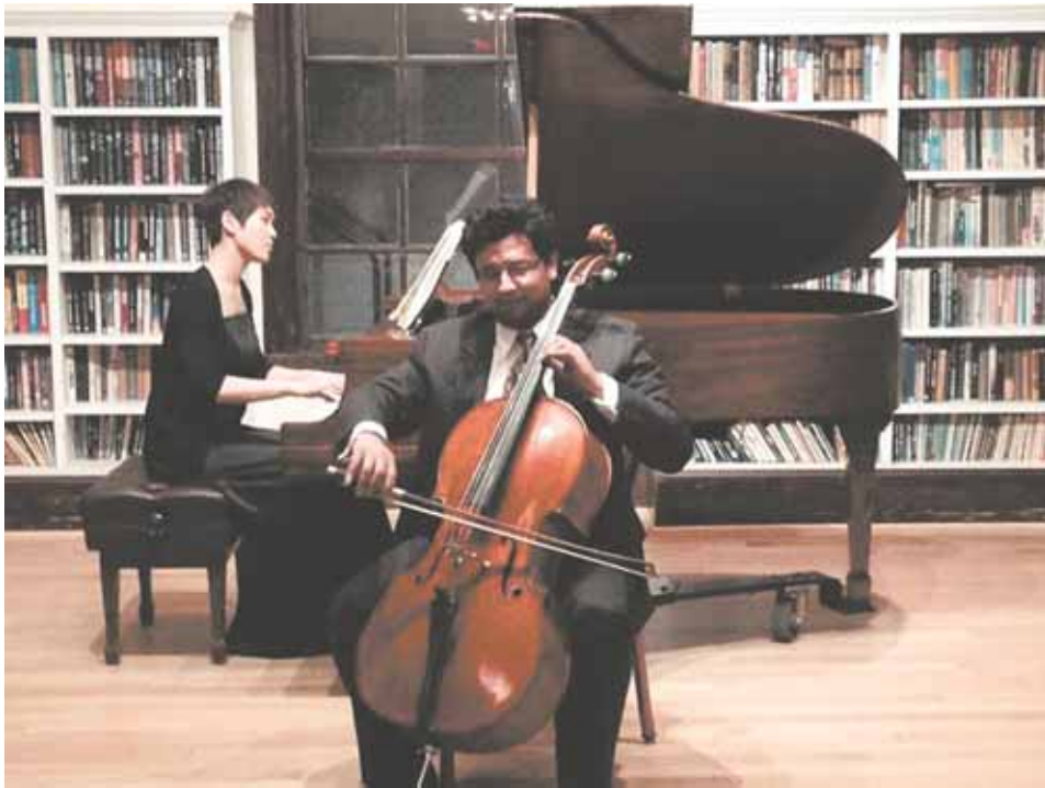
A concert in Fairfax's Old Town Hall.