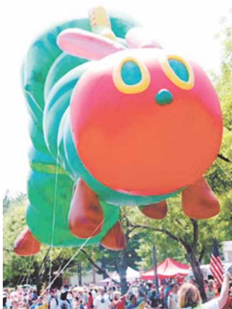
The Very Hungry Caterpillar flies high in Fairfax's Fourth of July parade.