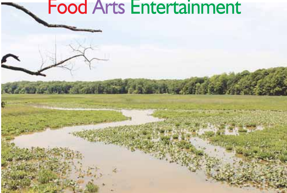
The Joseph V. Gartlan Jr. Great Marsh Trail provides spectacular views of the 250-acre Great Marsh, one of the largest on the Potomac River.