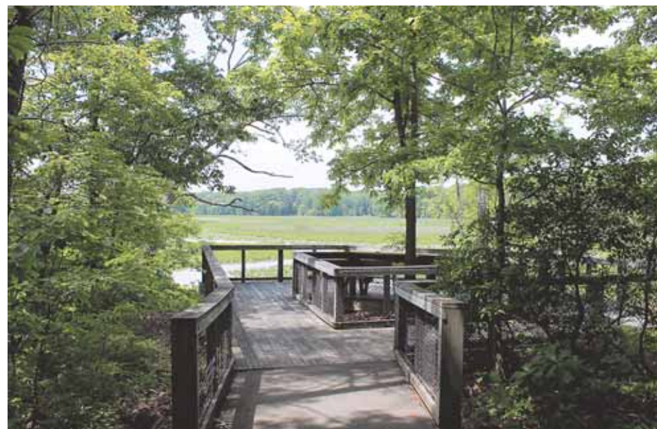
The Joseph V. Gartlan Jr. Great Marsh Trail is wheel-chair accessible and only three fourths of a mile each way, making it perfect for the entire family.