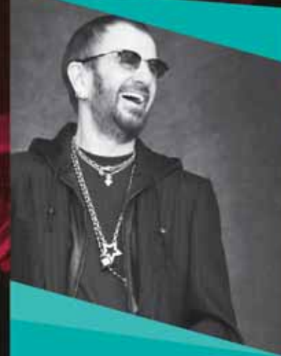
RINGO STARR & HIS ALL-STARR BAND Steve Lukather, Todd Rundgren, Gregg Rolie, Richard Page, Mark Rivera, and Gregg Bissonette JUNE 12