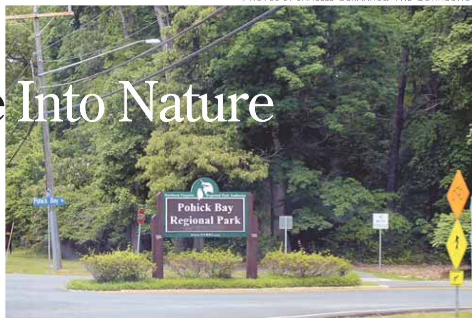
Not far from the entrance to the Joseph V. Gartlan Jr. Great Marsh Trail is Pohick Bay Regional Park, which includes free admission for residents of Fairfax County. The park is also home to the Pirate's Cove Water Park.

On Saturday, June 7, pirates will battle and invade the park for the annual Pirate's Day celebration.