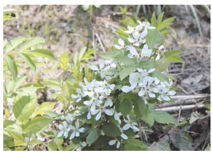
Huntley Meadows is home to beautiful wildflowers such as these.