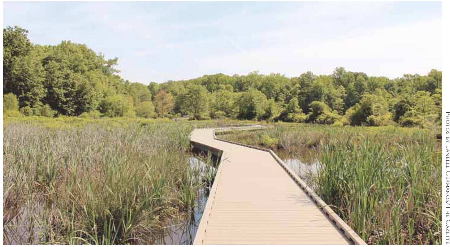
A walk along the boardwalk at Huntley Meadows is a great way to spend a couple of hours this summer.