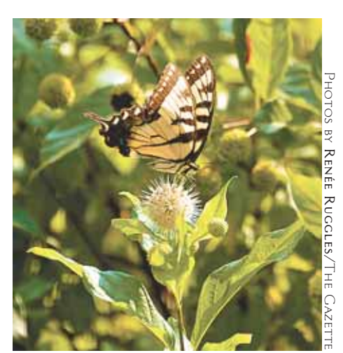
During the summer, Huntley Meadows Park becomes a great place for butterfly spotting.