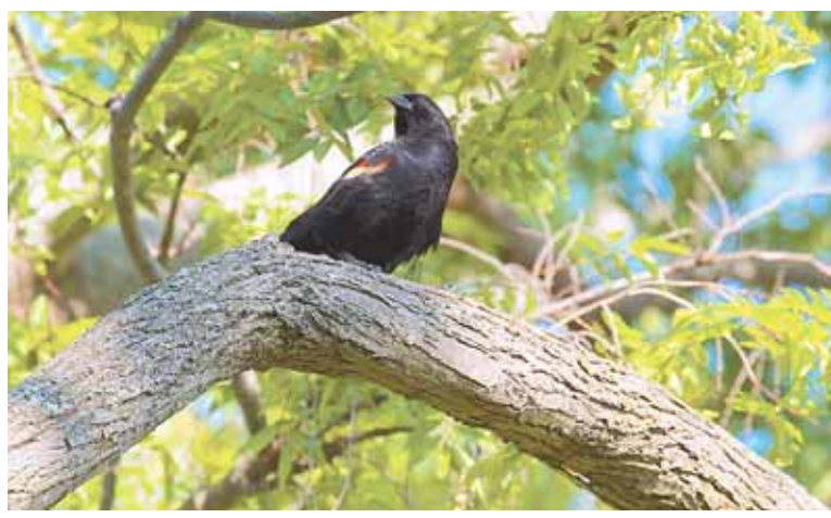
The Red-winged Blackbird is one of nearly 300 types of birds that come to the Dyke Marsh Wildlife Preserve.

Boats rented and launched at the Belle Haven Marina can be taken out to explore the restored Dyke Marsh. Friends of Dyke Marsh have volunteer opportunities on Friday to remove invasive plants. On Sunday mornings they meet to bird watch. On Saturday nights they offer an Evensongs Service with a barbecue afterwards.