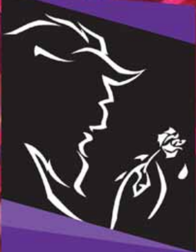
DISNEY'S BEAUTY AND THE BEAST JUNE 6-8