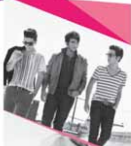
IL VOLO JUNE 13