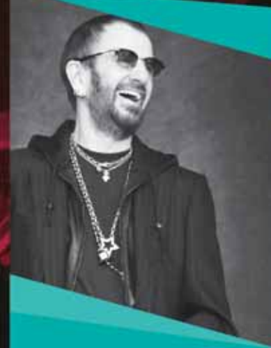
RINGO STARR & HIS ALL-STARR BAND Steve Lukather, Todd Rundgren, Gregg Rolie, Richard Page, Mark Rivera, and Gregg Bissonette JUNE 12