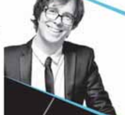
BEN FOLDS NATIONAL SYMPHONY ORCHESTRA Steven Reineke, conductor JUNE 25