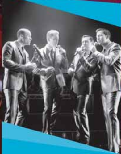
UNDER THE STREETLAMP GENTLEMAN'S RULE Retro Jersey Boys quartet with male a cappella powerhouse MAY 30