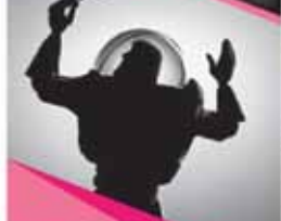
JOHN BUTLER TRIO ALLEN STONE JUNE 18