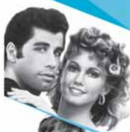
SING-A-LONG GREASE Full Film & Lyrics! JUNE 21