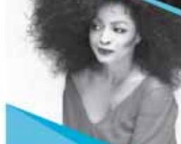
DIANA ROSS JUNE 29