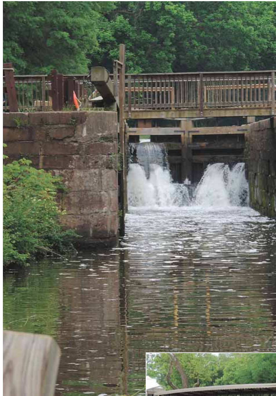
Water rushing into Lock 20 in front of the Great Falls Tavern Museum.

When in the park, visitors can access special C&O locations, called "discoveries," on their own personal mobile device. Each discovery, narrated by a National Park Service ranger, includes nearby points of interest, a photo gallery of historic and contemporary photos, links to videos and podcasts