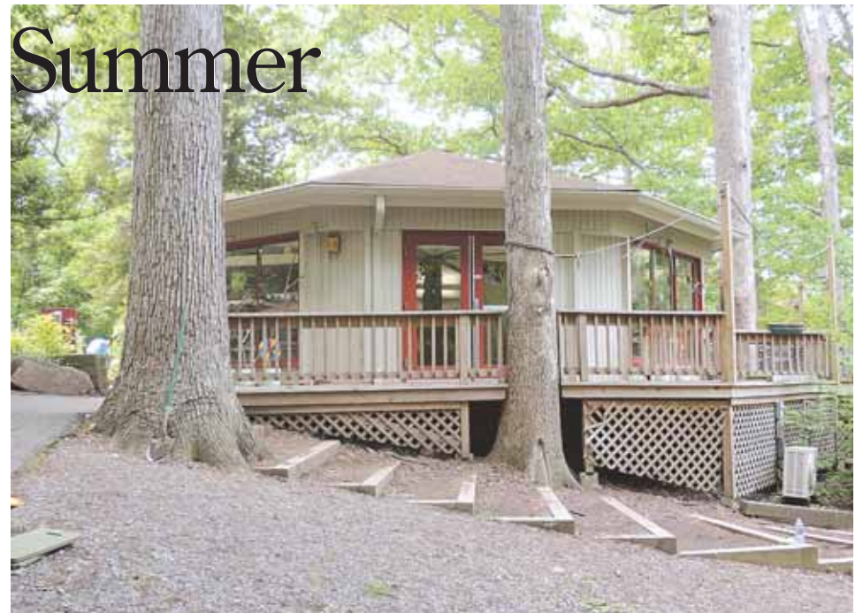
Tulip Tree Trail is just one of the hiking trails at Locust Grove Nature Center.

Located in Gaithersburg, the pool is like a dream vacation on an island resort with palm trees, multiple slides, floatable animals, and a “tumble bucket” water feature for children to enjoy. The pool also has a zero-depth entry, making it accessible to all. A major attraction at the water park (for those 48 inches and taller) is the double water slide that is 250 feet long and twists and turns into the main pool. For the adventuresome, the blue slide offers a breathtakingly fast ride, while the white slide offers a tamer, slower water journey. Bohrer Park also has a 12,300-square-foot skate park, designed for skateboards, inline skates and BMX bikes as well as a miniature golf course. To find out more, go to www.gaithersburgmd.gov .