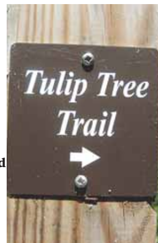
One of the messages of the Locust Grove Nature Center

Locust Grove Nature Center offers trails, hiking and learning about nature.