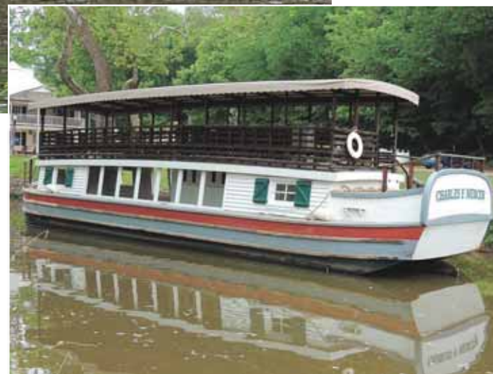
The replica of the canal boat is pulled by mules.

Whether interested in living history, bike patrolling, park maintenance, or staffing a visitor center, the C&O Canal has many volunteer jobs. Go to www.chohvip.org for news and events in the park's volunteer program. Register to be a volunteer at http://www.nps.gov/choh/supportyourpark/volunteer.htm .