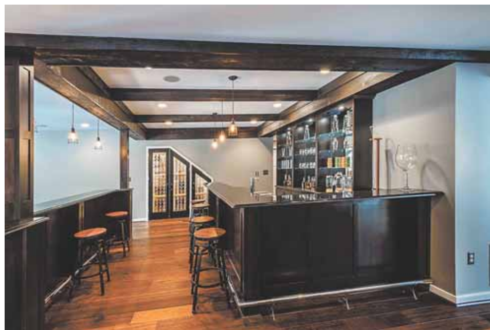
Owners wanted interactivity in the primary gathering areas. The Anglo-Irish “drink rail” separates the bar from the billiards room. Pre-finished oak flooring visually unifies the pub, the billiards room and the adjacent media room.

Foster Remodeling Solutions periodically offers workshops on home remodeling topics. For Information: 703/550-1371 or www.fosterremodeling.com