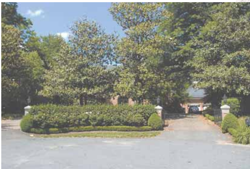
3 6022 Orris Street, McLean — $2,869,500