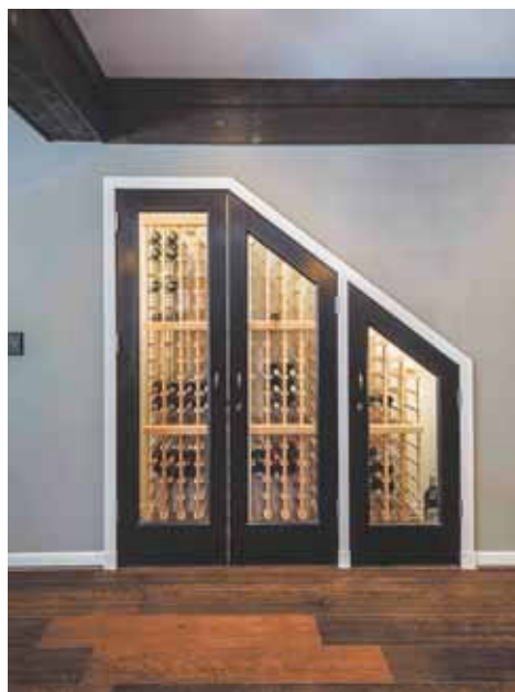
A wine rack built under the staircase and lit from behind is both practical storage space and a festive icon that sets off an otherwise empty wall.

Every aspect of the interior design needed to be developed, much of it in pursuit of a very specific ambiance, starting with the replica Irish pub.