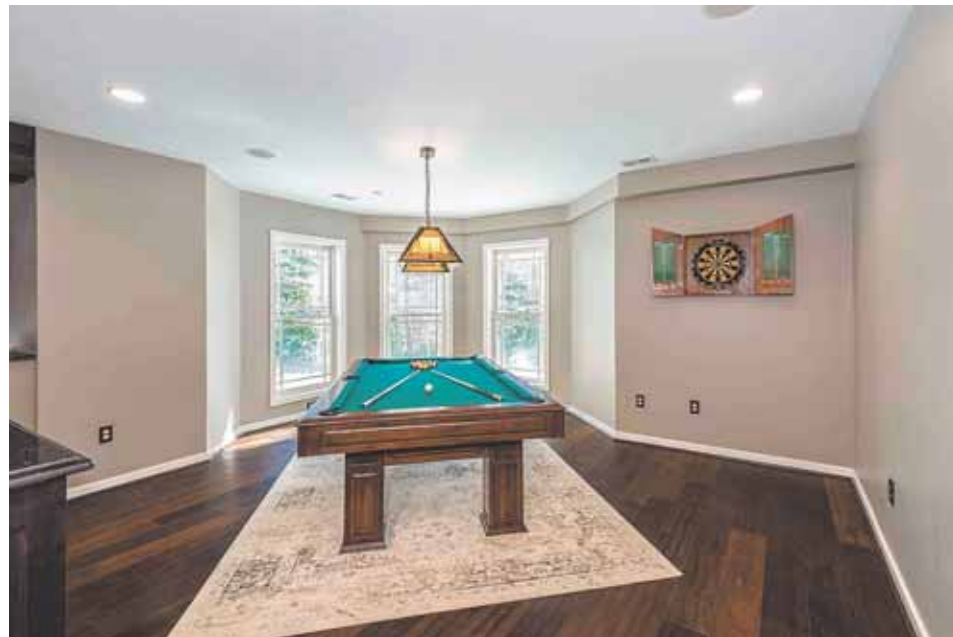
The billiards room, visually linked the suite’s other public spaces, was designed to accommodate a regulation-sized pool table.

Backbar cabinets are in cherrywood with a dark espresso stain. For contrast, mirrored wall panels, glass shelves and halogen lighting create a sparkling surface any pub aficionado will admire.