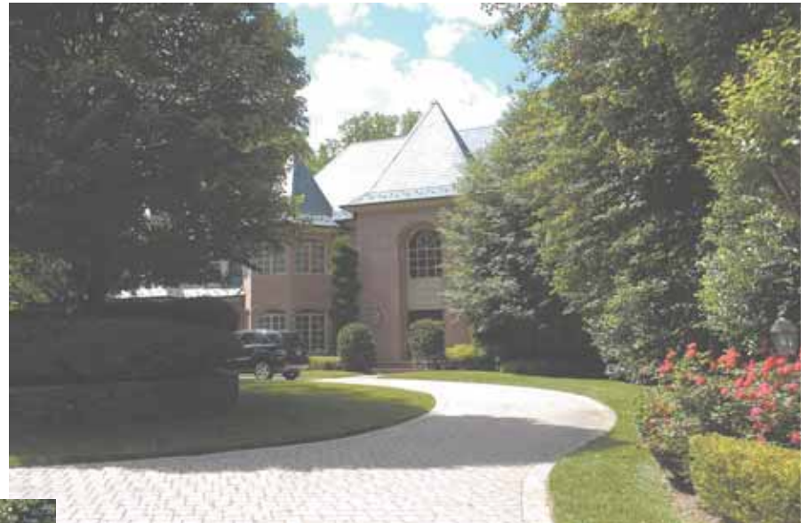
2 6718 Benjamin Street, McLean — $3,400,000