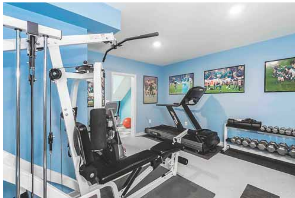
Accessible only through a back hall, the 200-square-foot fitness center offers weight machines and a treadmill in a brightly lit room adorned with photos of the owner’s favorite sport: rugby.