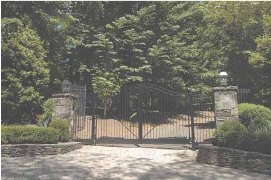
1 211 Clarks Run Road, Great Falls — $3,675,000

IN APRIL 2014, 19 GREAT FALLS HOMES SOLD BETWEEN $3,675,000-$565,000 AND 102 HOMES SOLD BETWEEN $3,400,000-$162,750 IN THE MCLEAN AND FALLS CHURCH AREA.