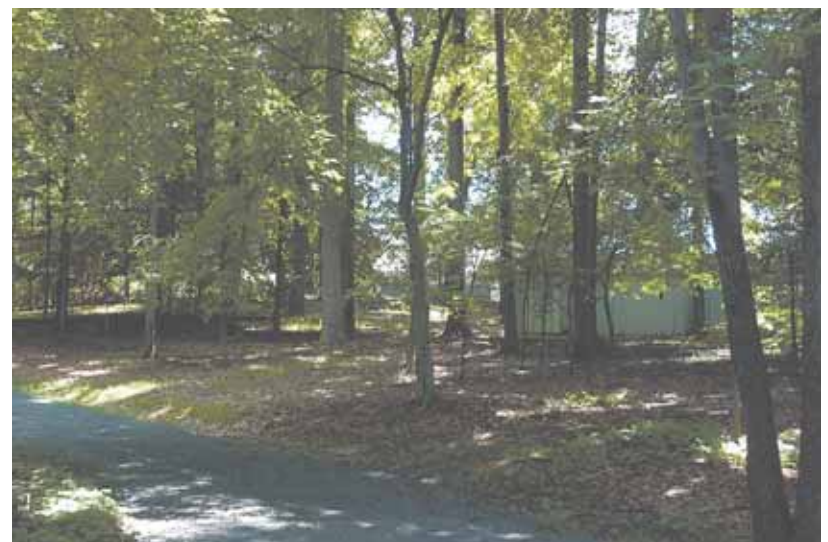
4 123 Commonage Drive, Great Falls — $2,250,000