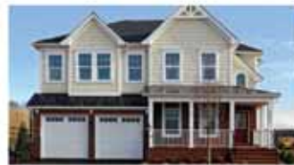
The Hemsworth Collection EDGEWOOD AT BRAMBLETON Craftsman-style Single Family Homes from the mid $600's. Phone: 703.764.5481