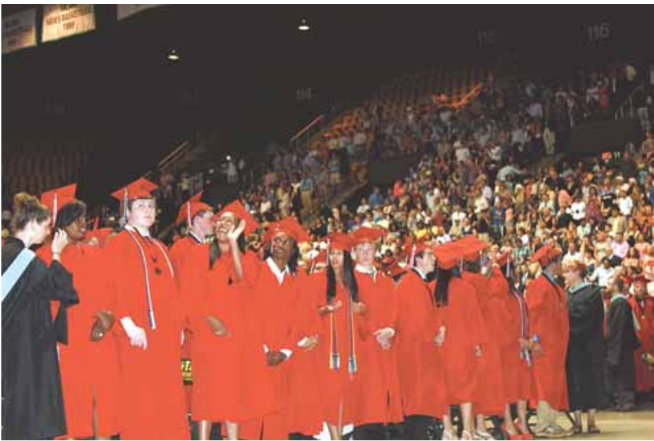
Students wave to their parents at Herndon High School's graduation at the Patriot Center on Monday.