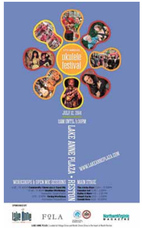
Lake Anne Ukulele Festival will be held Saturday, July 12