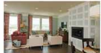
The Brixton Collection CLOVER HILL AT BRAMBLETON 3-level Urban-inspired Townhomes from the mid $400's. Phone: 703.764.5448