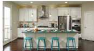
The Townsend Collection CLOVER HILL AT BRAMBLETON 3-level Urban-inspired Townhomes from the upper $400's. Phone: 703.764.5441