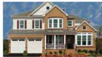
The Woodview Collection NORTHSTAR AT BRAMBLETON Single Family Homes from the low $700's. Phone: 703.764.5478

TOUR 6 ALL-NEW MODELS THIS SAT. & SUN., 6/28-29, 11AM-6PM. REFRESHMENTS, DOOR PRIZES AND MORE!