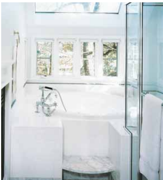
Through the use of contemporary design, Kai Tong of Hopkins & Porter Construction, Inc. created a master bathroom that is a private sanctuary for renewal and reflection.