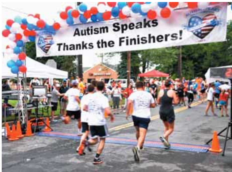
Runners finish the 14th annual Autism Speaks 5K.