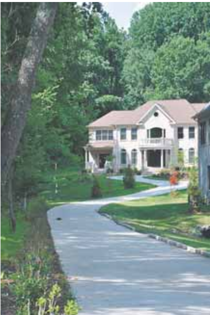
3 10507 Tulip Lane — $2,200,000