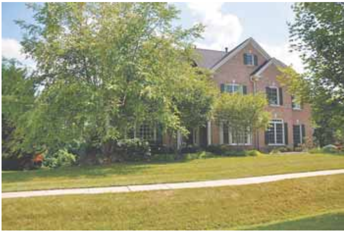
4 9804 Carmelita Drive — $1,760,000