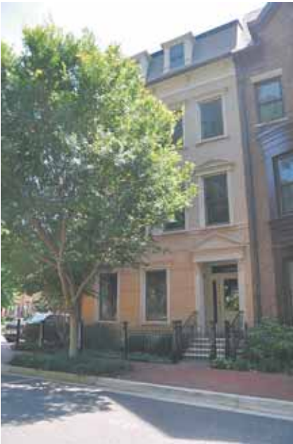
7 12410 Ansin Circle Drive — $1,315,000