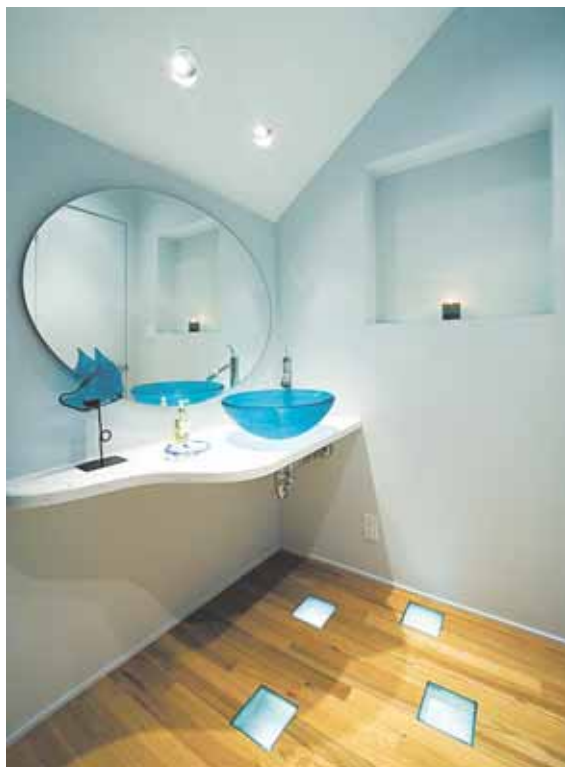
This bold blue powder room includes an Aquavit lavatory bowl and faucet with an undulating Silestone countertop.