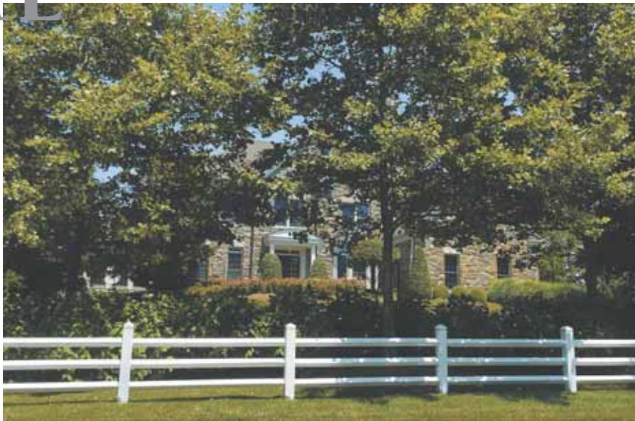
1 3514 Rose Crest Lane, Fairfax — $1,350,000