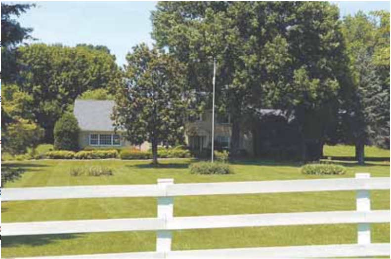
6 12710 Knollbrook Drive, Clifton — $1,000,000