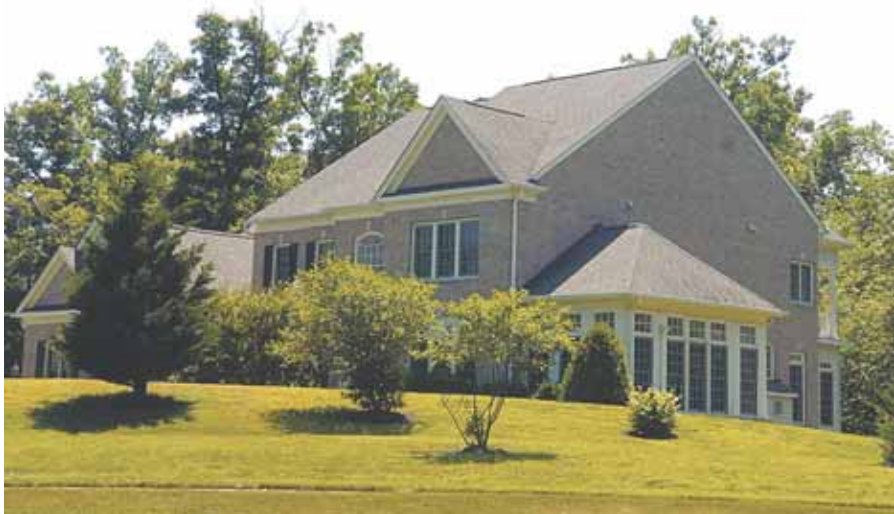
4 8796 Pohick Creek View, Springfield — $1,015,000