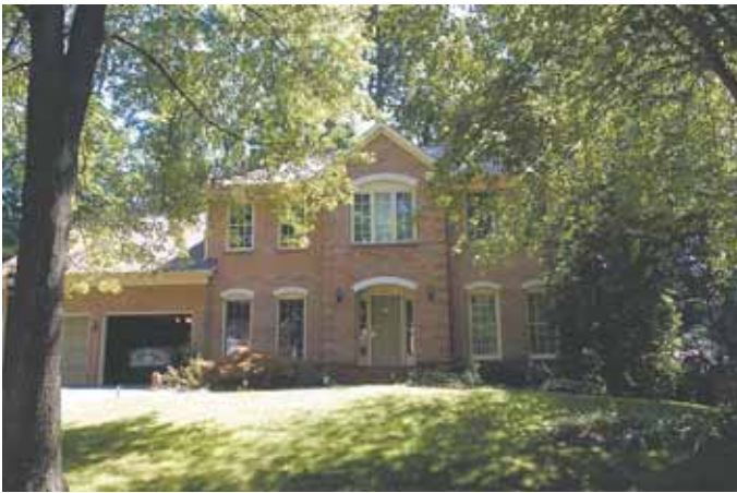
9 5409 Mount Corcoran Place, Burke — $729,900