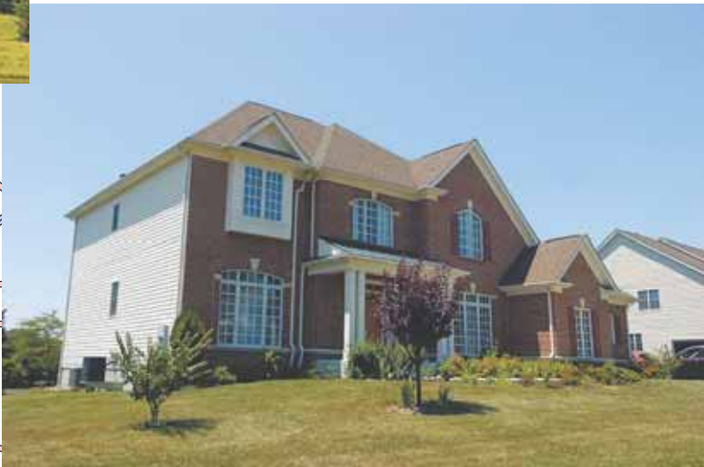
5 4722 Benjamin Cross Court, Chantilly — $1,010,000