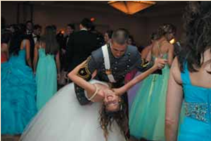
Debutantes and cadets dance during the Old Dominion Cotillion.

Debutantes and cadets gather for the Old Dominion Cotillion on Saturday, July 19, in the Washingtonian Room of the Westfields Marriott in Chantilly. This was the signature annual event of the ODC, in which debutantes officially make their entrance into Virginia society. The ODC, a philanthropic organization, was developed to promote social responsibilities and graces within the education of young women. The cadets were from Fishburne Military School in Waynesboro, Va. The school, founded in 1879, is the oldest continually operating military school in Virginia.