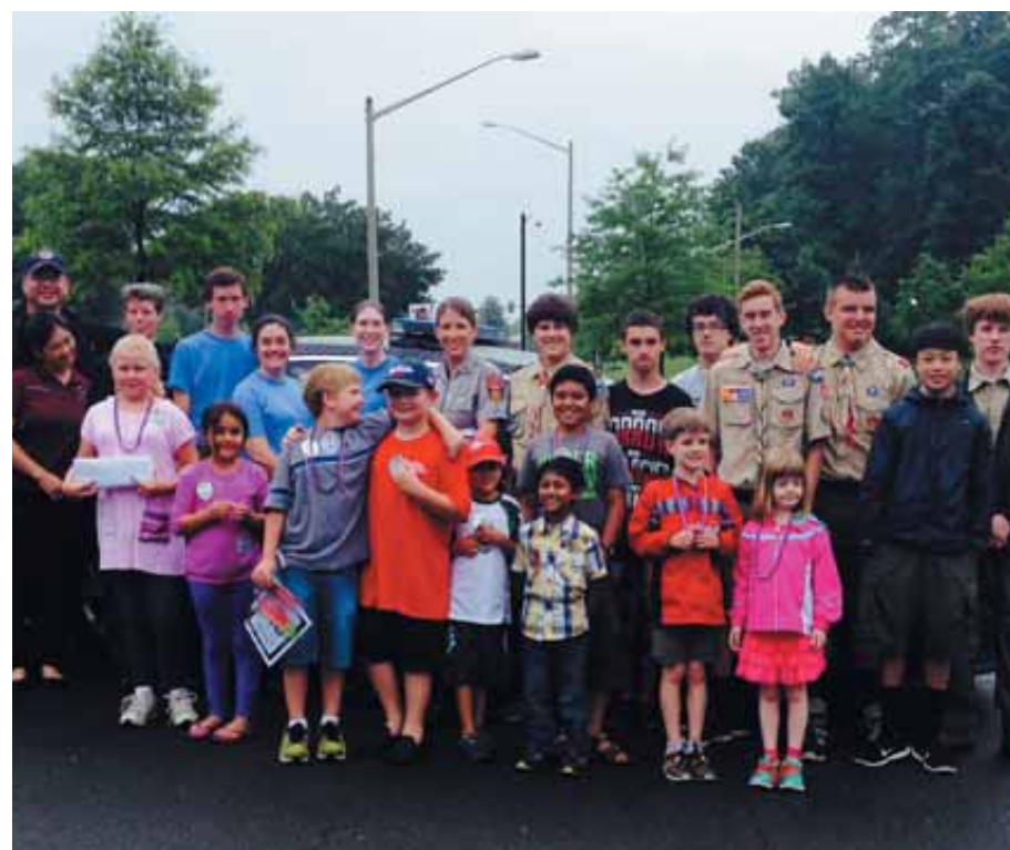
Group shot of Safetypalooza attendees, Scouts and Fairfax County fire and police personnel.

To apply, go to http://www.fairfaxcounty.gov/police/services/citizens-police-academy.htm or email CPA@fairfaxcounty.gov .