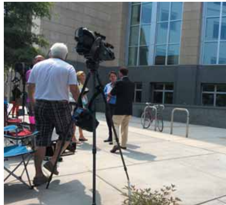
Members of the media congregate outside the federal courthouse in Richmond.