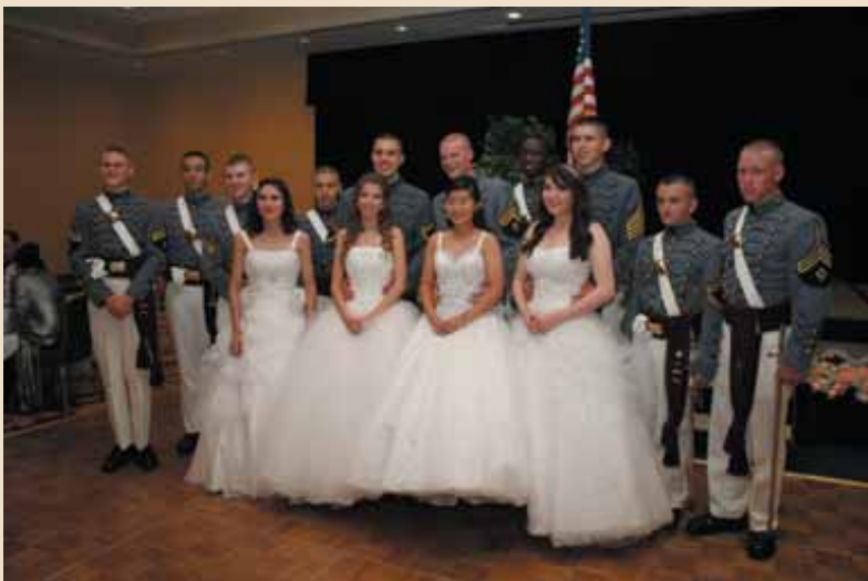
Debutantes from the Old Dominion Cotillion were escorted by military cadets in their traditional uniforms. The young women volunteered over 200 hours of service time last year to the Katherine E. Hanley Family Shelter. ODC's motto calls for "Volunteerism, Dedication, Integrity and Leadership."