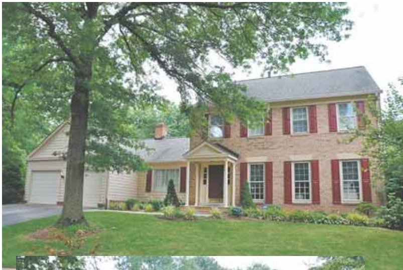
4 6 Canfield Court — $935,000