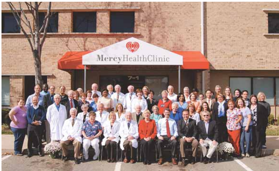
Mercy Health Clinic volunteer doctors, nurses and staff.