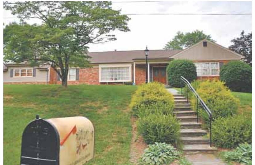
3 9908 Carmelita Drive — $970,000