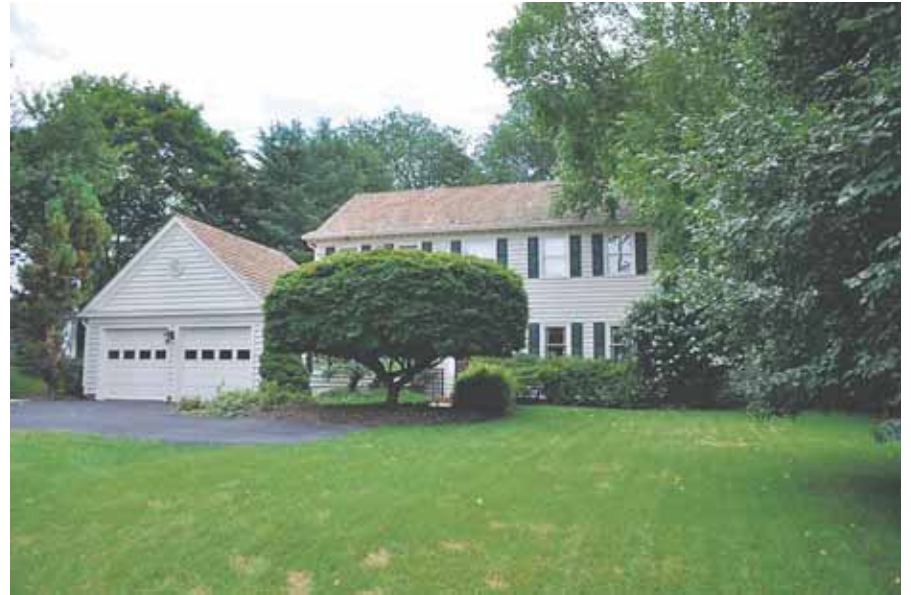
2 8316 Bells Mill Road — $974,000