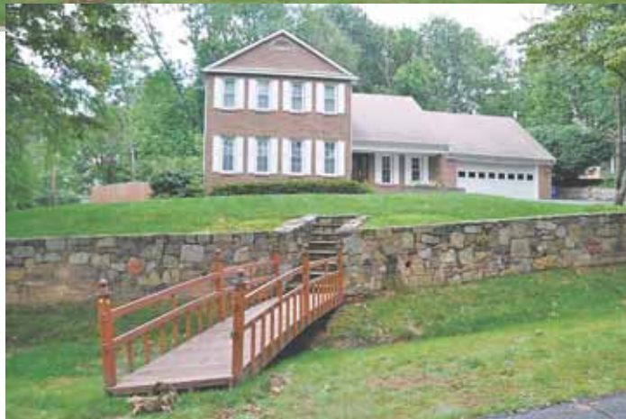
6 9705 Wilden Lane — $900,000