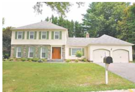
7 9423 Jongroner Court — $875,750