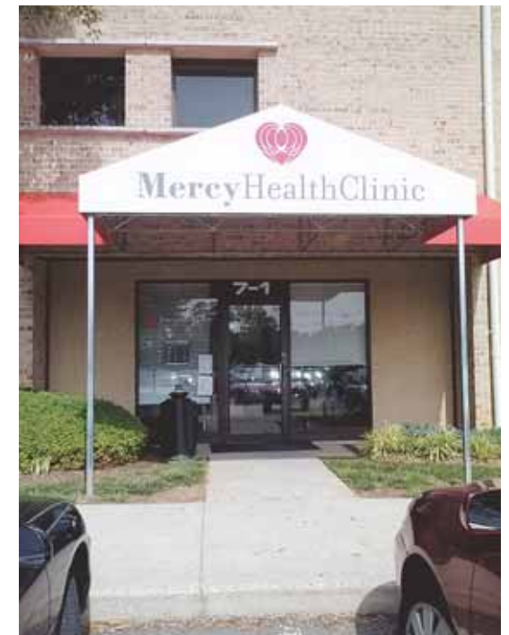
The Mercy Health Clinic