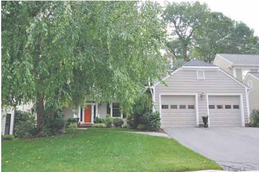
1 10240 Sundance Court — $986,000